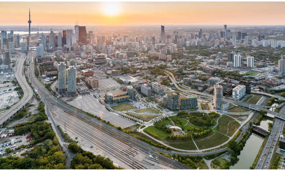
Canary District in the City