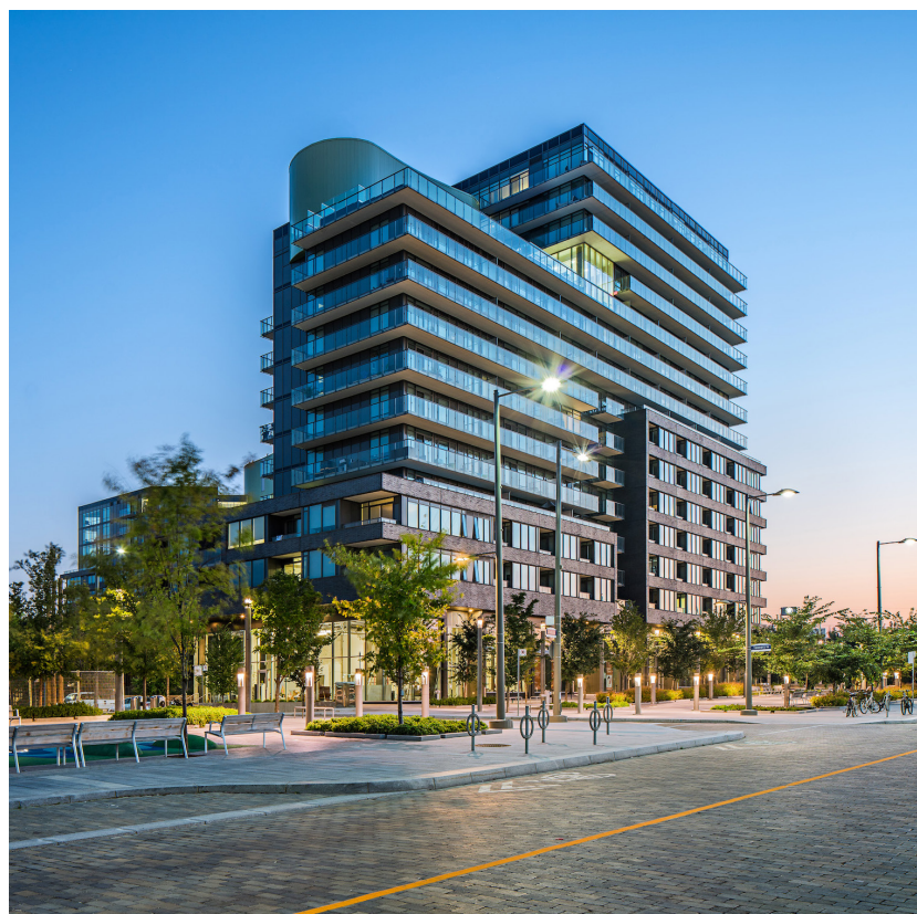
Canary Park Condominiums at Canary District