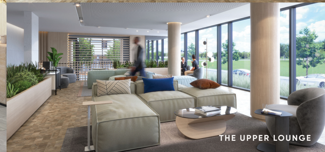
THE UPPER LOUNGE