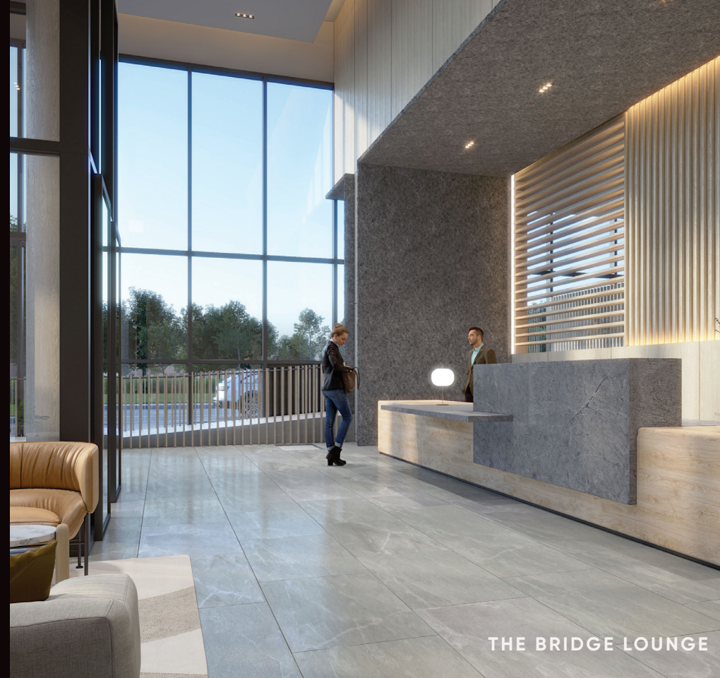
THE BRIDGE LOUNGE

Beyond The Upper Lounge you'll find the double-height windows of The Woodbine Coworking Space, designed to accentuate streetscape views. Beyond that; The Coast Club, a 5,000 square foot, state-of-the-art fitness centre with green feature walls, dynamic park views, ample cardio and strength training zones, and dedicated yoga and spin studios and steam rooms.