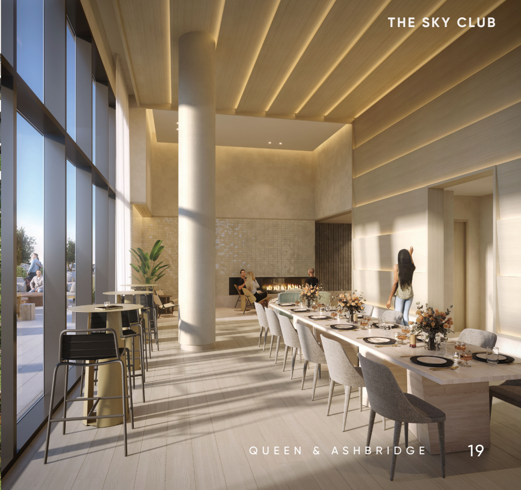
THE SKY CLUB