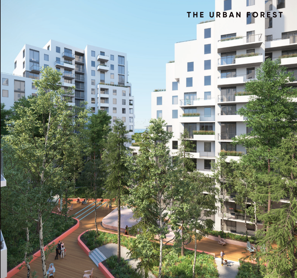
THE URBAN FOREST