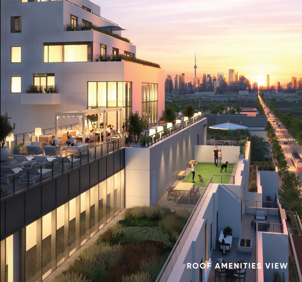
ROOF AMENITIES VIEW

Visitors to Queen & Ashbridge will be very well taken care of in the guest suites, which raise the bar for accommodations to built-in boutique hotel heights.