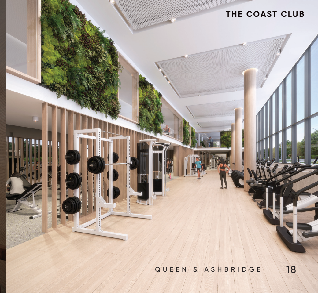
THE COAST CLUB