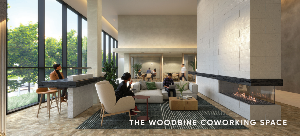
THE WOODBINE COWORKING SPACE