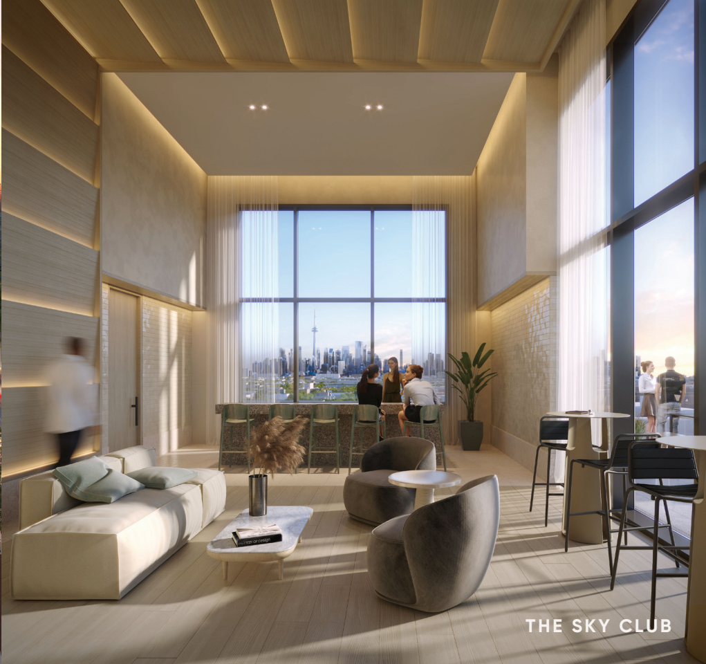
THE SKY CLUB