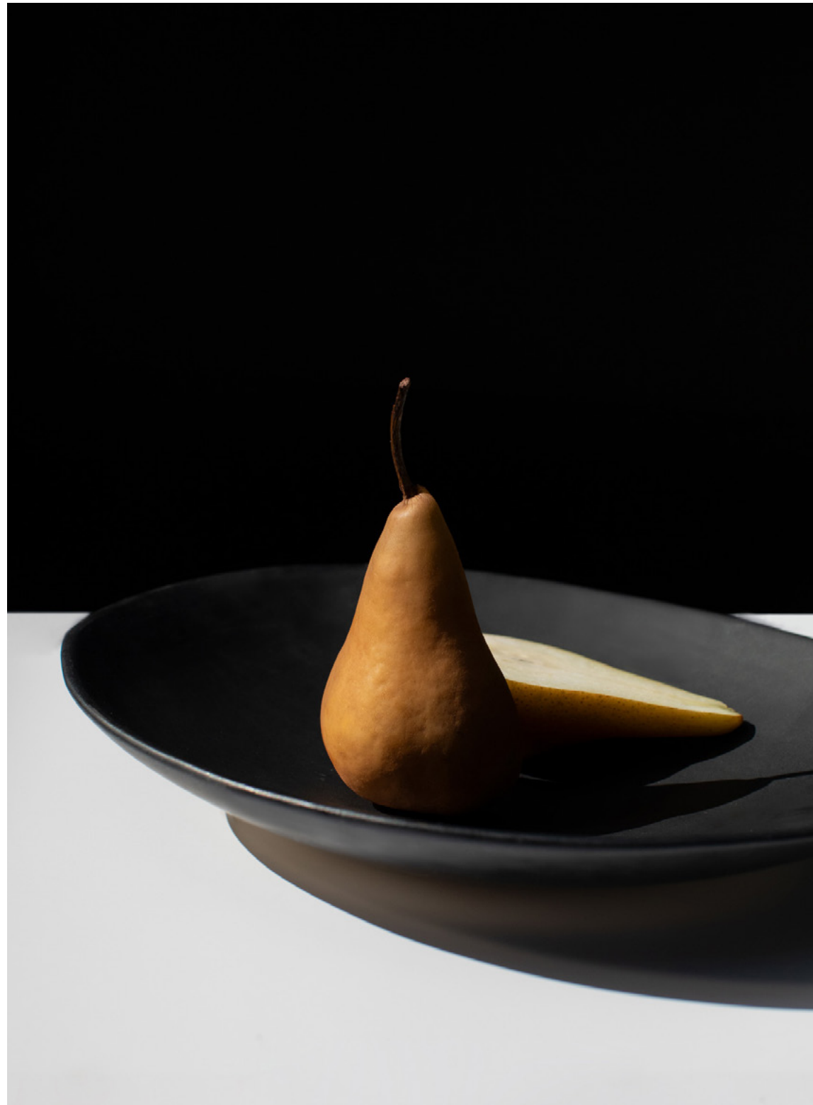
York Farmers Market 7509 Yonge Street