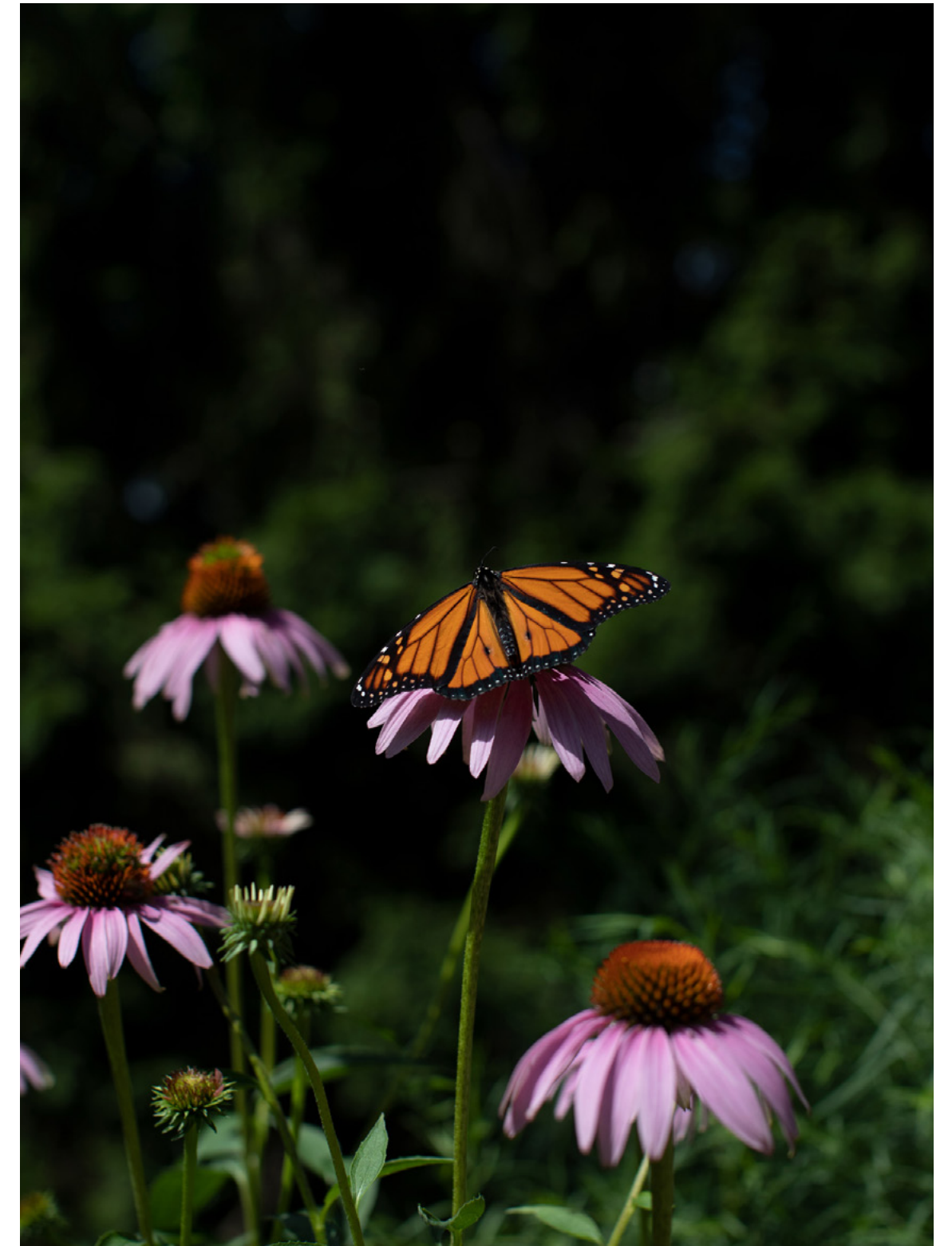
East Side of the Garden Pathway

Outside, the unlimited appeal of coveted Thornhill is at your doorstep. Yonge Street's iconic cafés, boutiques, bars, and restaurants are all nearby, with established parks, golf clubs, and schools within walking distance. 8188 Yonge is also an extremely well-connected address. The Viva rapid transit system is right outside, major transit stations and highways are close by, and the future TTC Yonge extension is only a five-minute walk away.