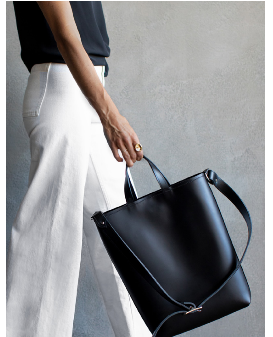
Hillcrest Mall 9350 Yonge Street