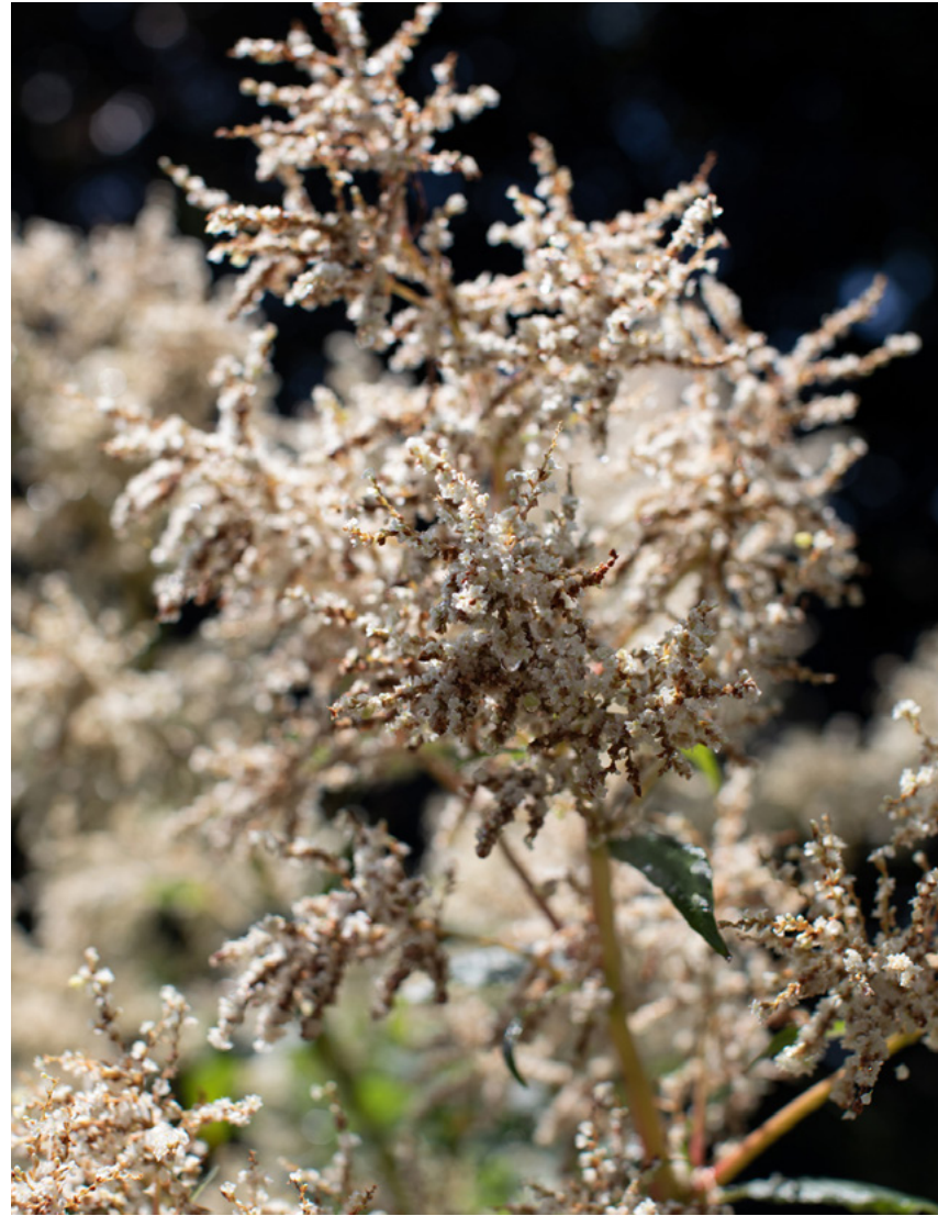
West Side of the Garden Pathway