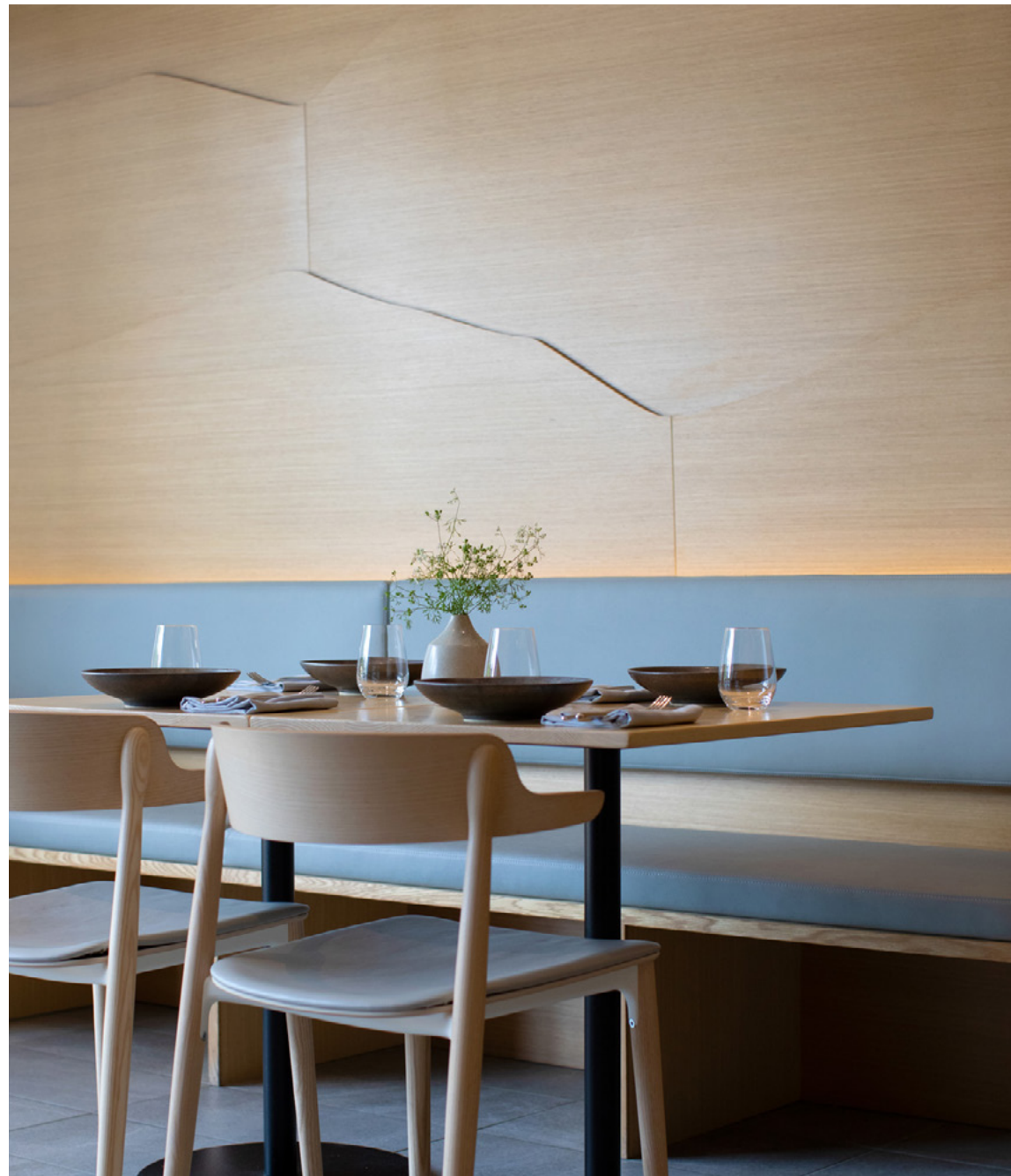
FRILU 7713 Yonge Street

The team at FRILU is devoted to warm hospitality combined with intricately prepared, yet humble, dishes. Showcasing the landscape of modern Canada, the creations are framed by classic Asian influences, aesthetics, and techniques. This restaurant is emblematic of Thornhill's character: effortlessly elegant, continually innovative, and full of pride.