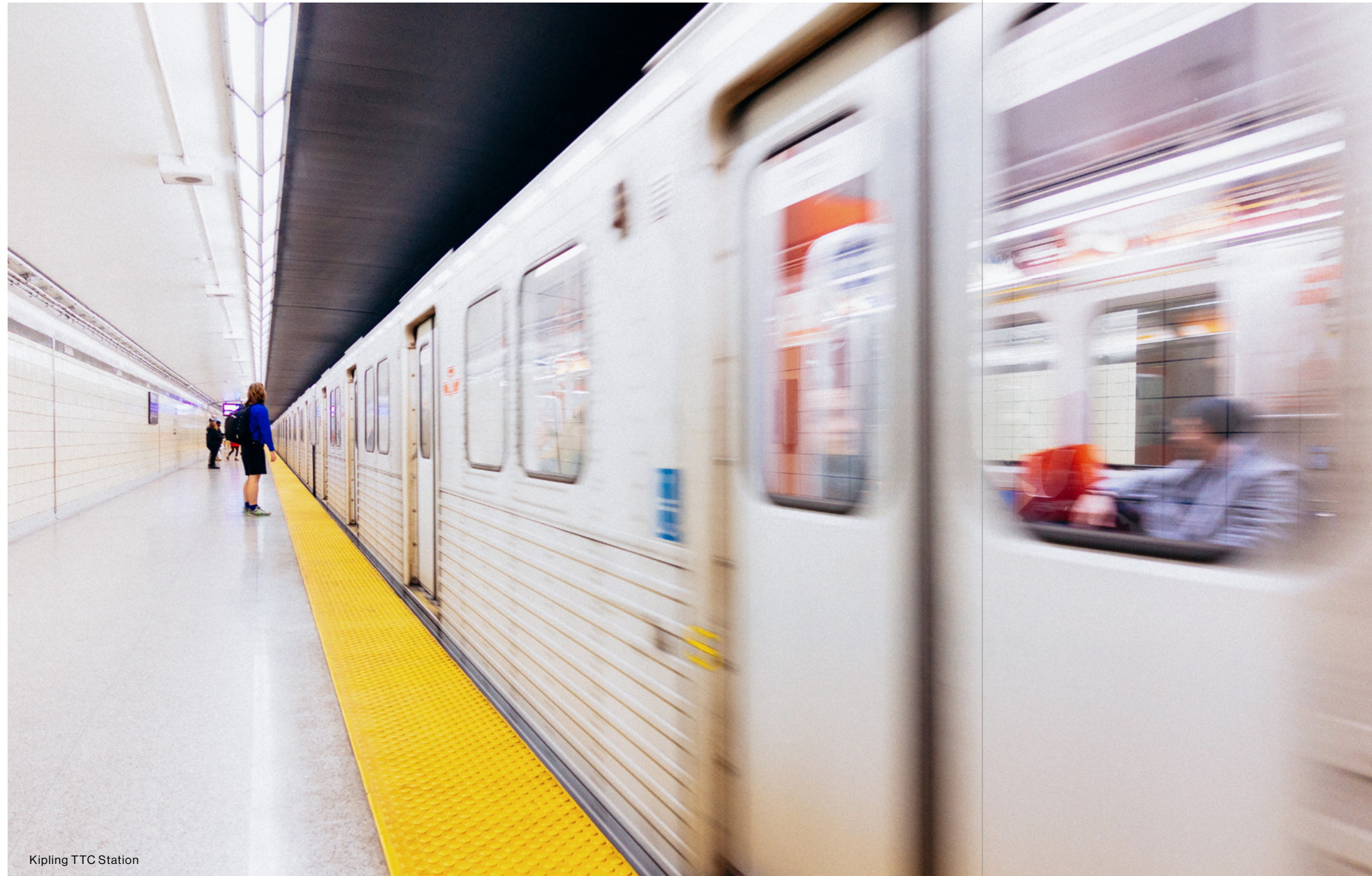
Kipling TTC Station