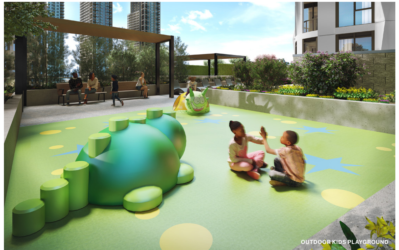
OUTDOOR KIDS PLAYGROUND