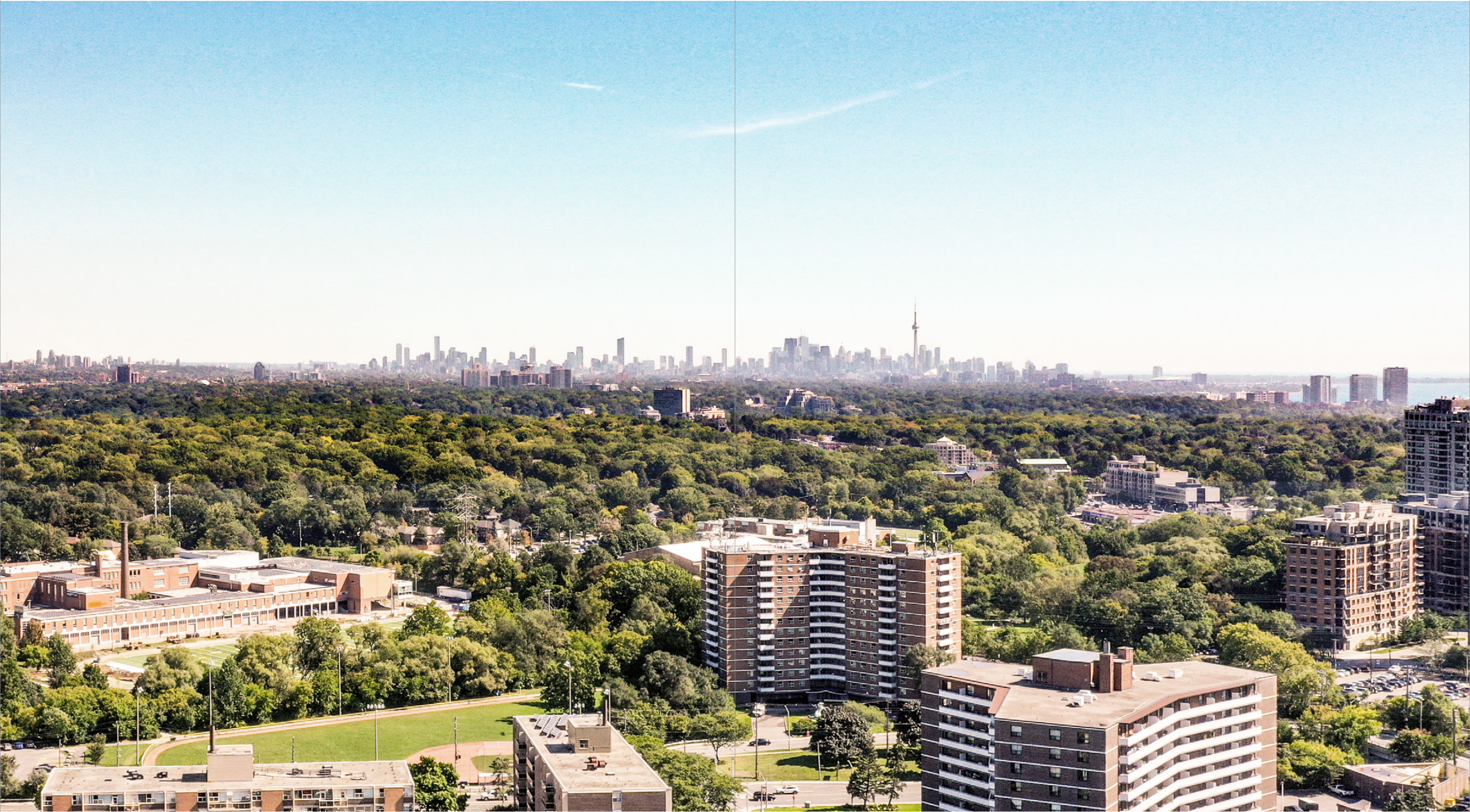
SOUTH EAST VIEW