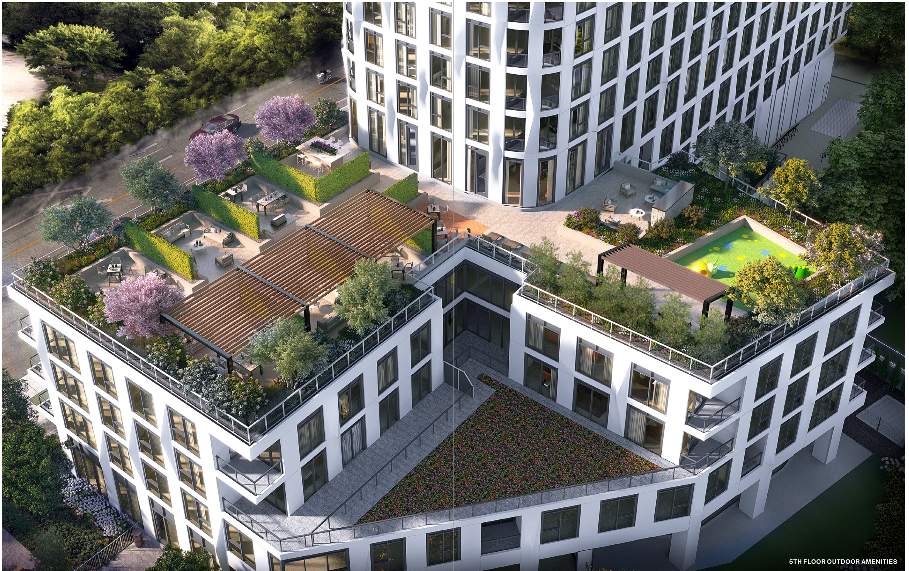
5TH FLOOR OUTDOOR AMENITIES