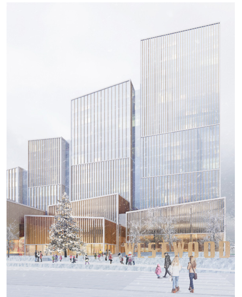
Future Etobicoke Civic Centre

Conceptual renderings of Etobicoke Civic Centre provided by City of Toronto. The Vendor shall not be liable or responsible for any warranties or representations made in terms of the creation and completion of any of the future proposed Etobicoke Civic Centre.