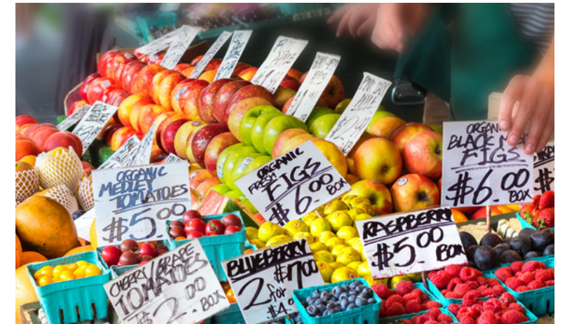
Bloor West Village