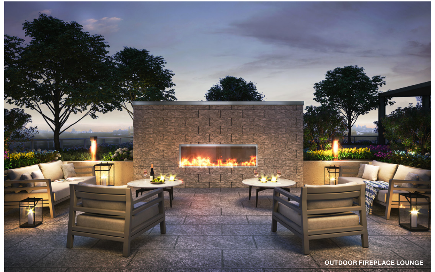
OUTDOOR FIREPLACE LOUNGE