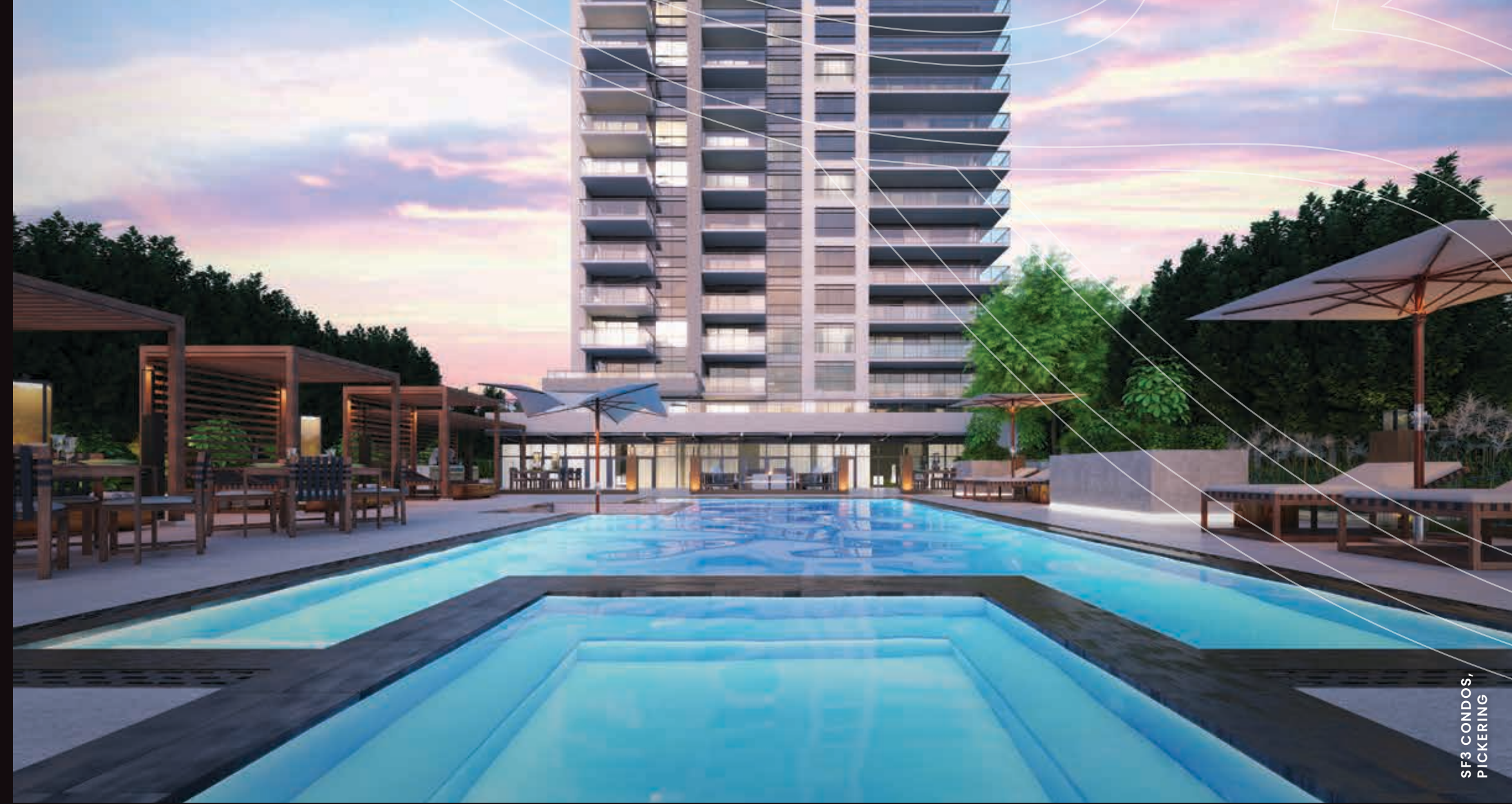
SF3 CONDOS, PICKERING