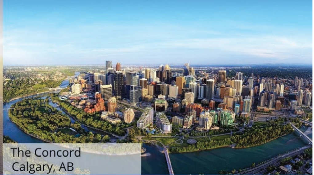
The Concord Calgary, AB