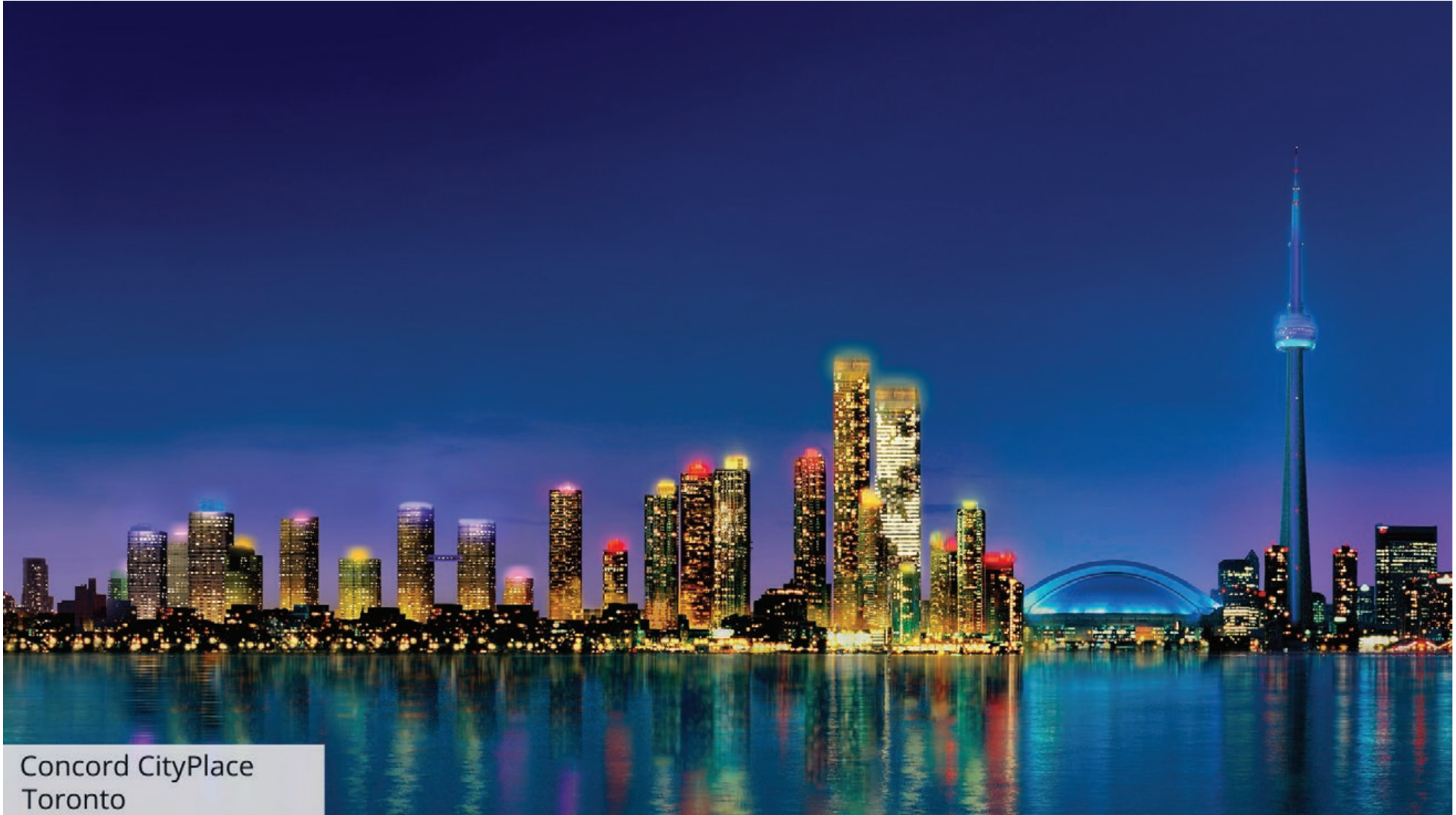
Concord CityPlace Toronto

Largest Urban Master-Planned Community in Ontario (Built)