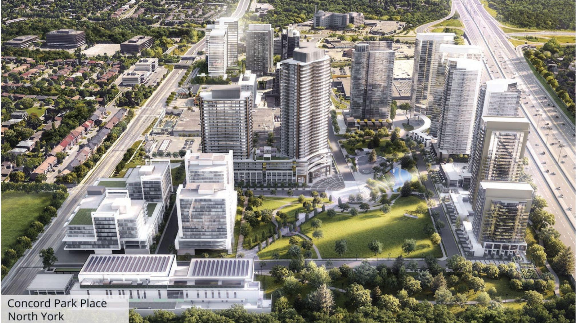
Concord Park Place North York

2 nd Largest Urban Master-Planned Community in Ontario (Built)