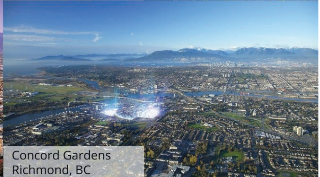
Concord Gardens Richmond, BC