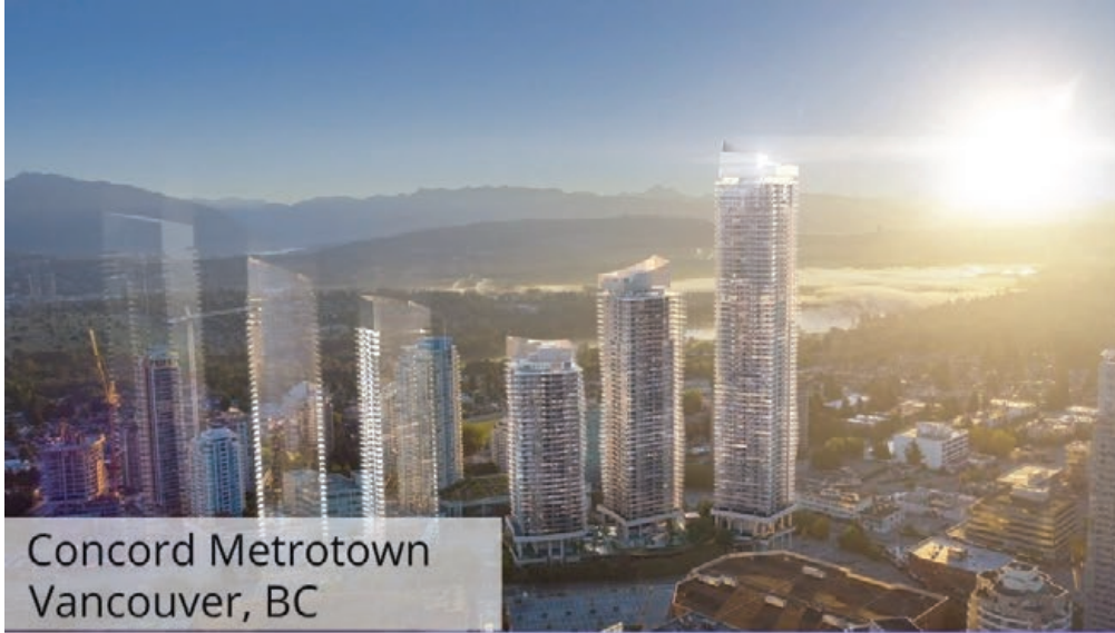
Concord Metrotown Vancouver, BC