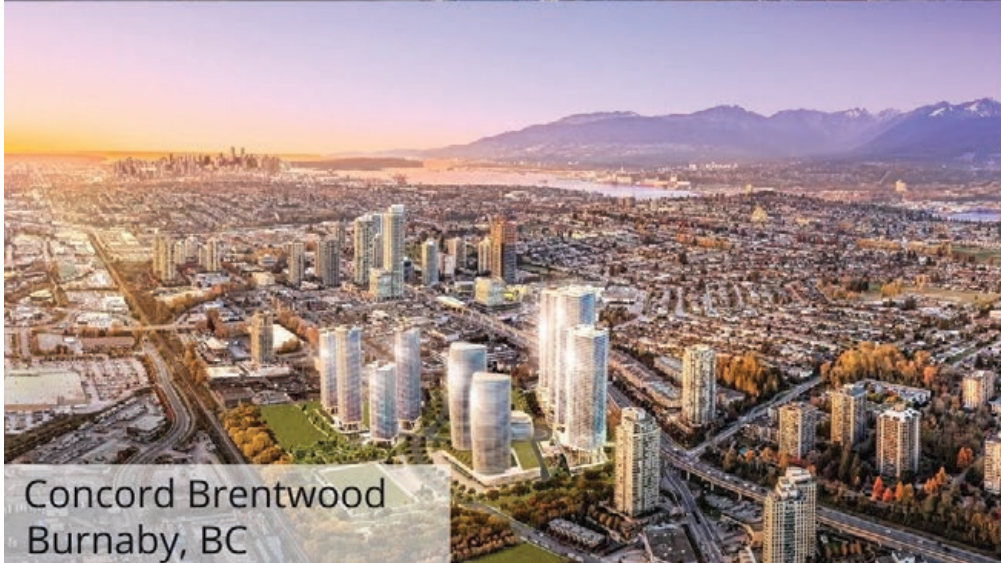
Concord Brentwood Burnaby, BC