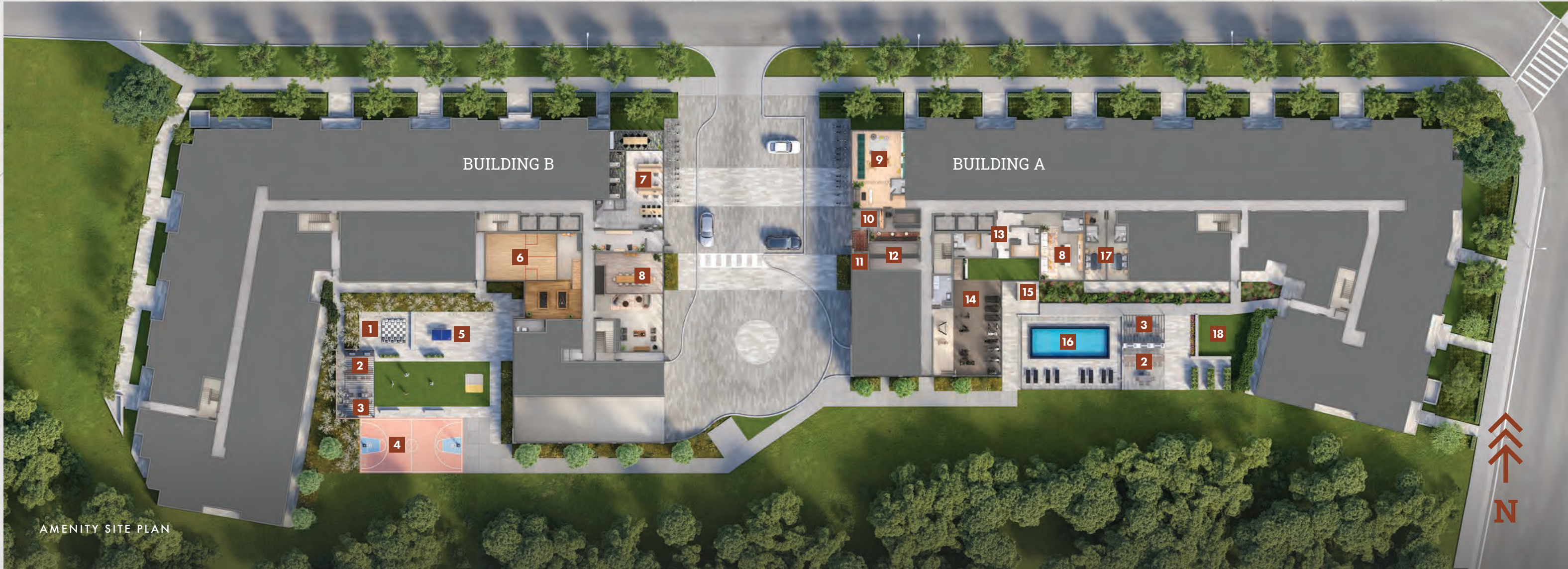
AMENITY SITE PLAN