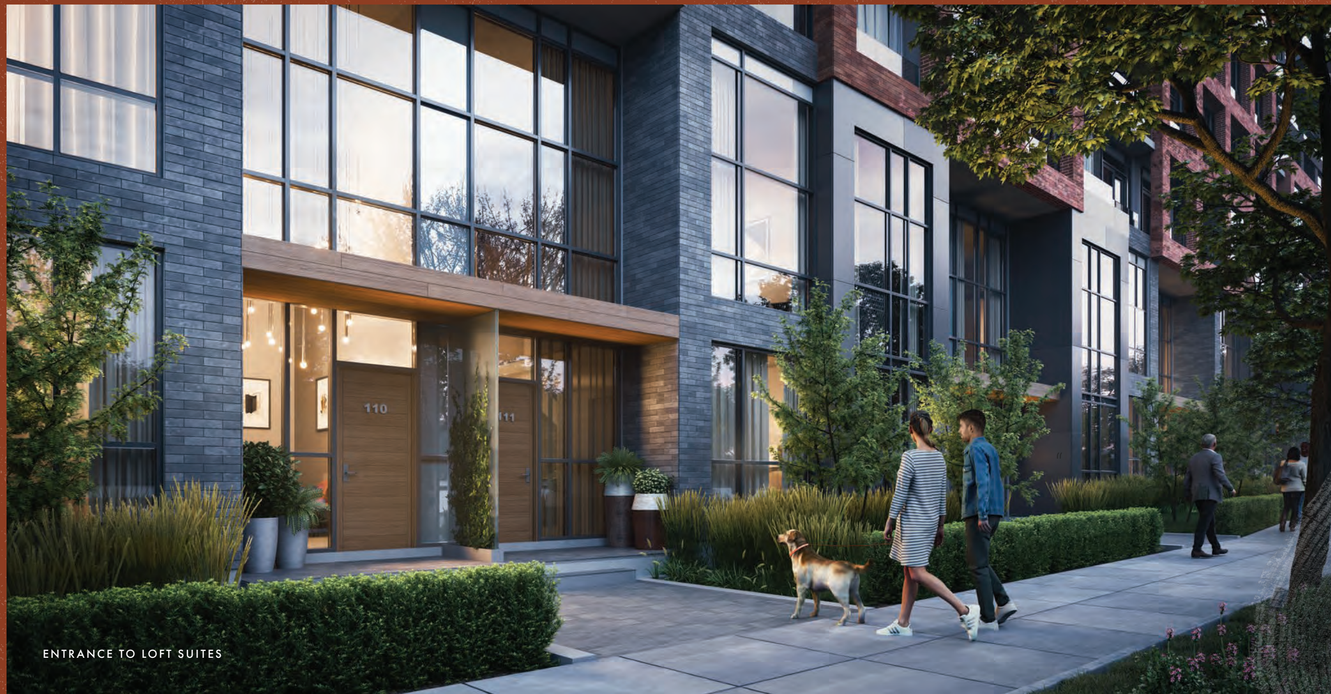
ENTRANCE TO LOFT SUITES

HAVE IT ALL AT HIGHLAND COMMONS. A CONDOMINIUM LIFESTYLE WITH THE ADDED PRIVACY OF YOUR OWN LANDSCAPED ENTRANCE.