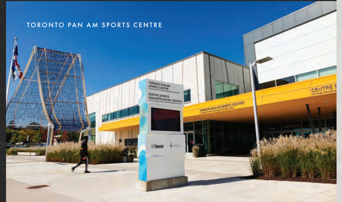
TORONTO PAN AM SPORTS CENTRE