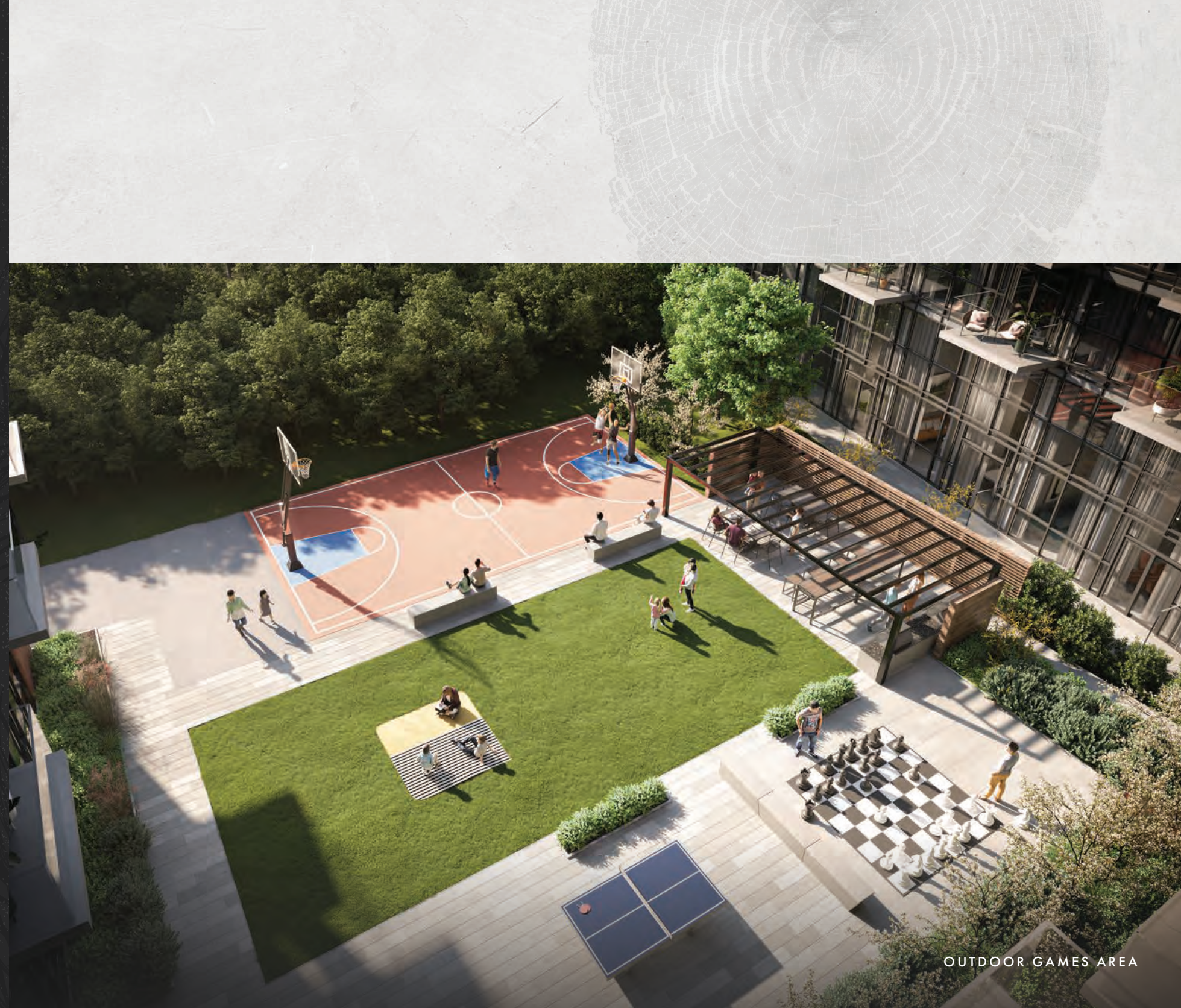
OUTDOOR GAMES AREA

The options are endless at Highland Commons.