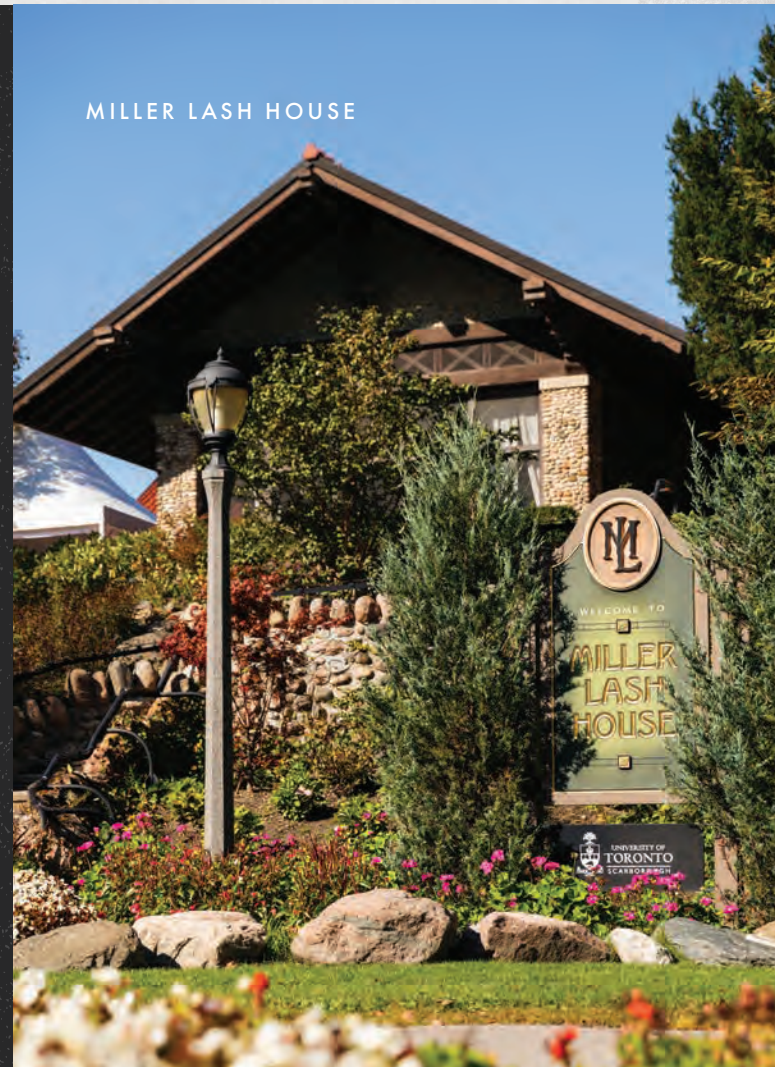
MILLER LASH HOUSE