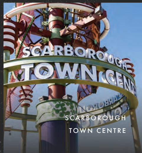
SCARBOROUGH TOWN CENTRE