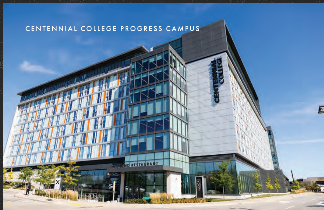
CENTENNIAL COLLEGE PROGRESS CAMPUS