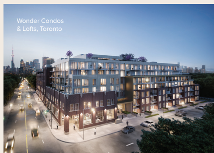
Wonder Condos & Lofts, Toronto