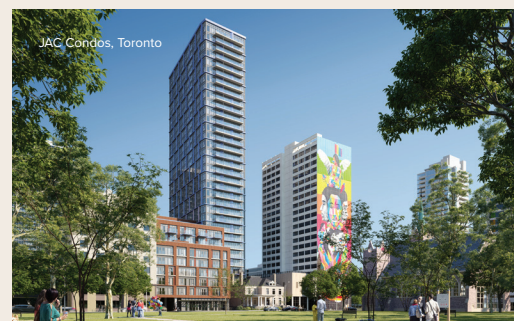
JAC Condos, Toronto