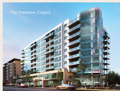
The Theodore, Calgary