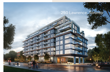
250 Lawrence, Toronto