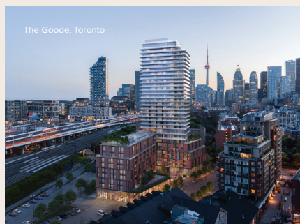
The Goode, Toronto