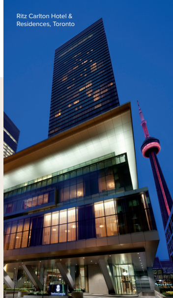
Ritz Carlton Hotel & Residences, Toronto