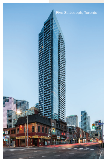
Five St. Joseph, Toronto