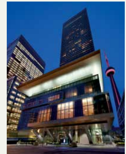
RITZ-CARLTON - TORONTO