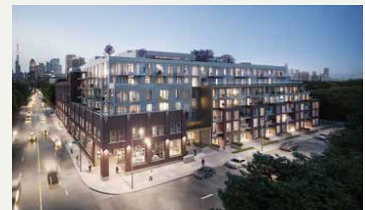
WONDER CONDOS - TORONTO