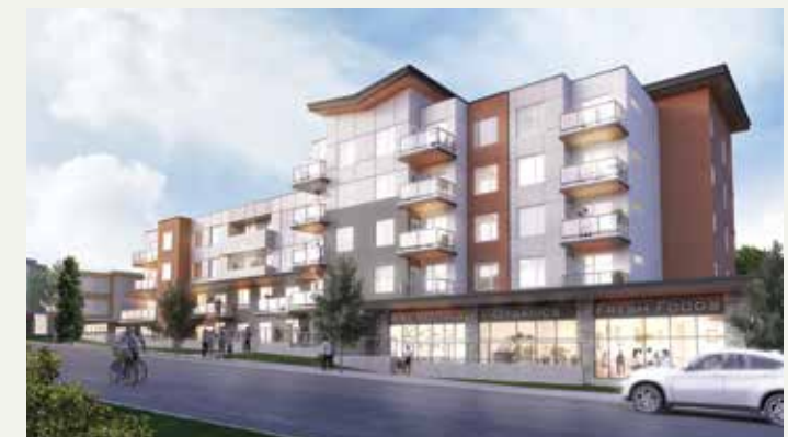
FISH CREEK EXCHANGE PH1 - CALGARY