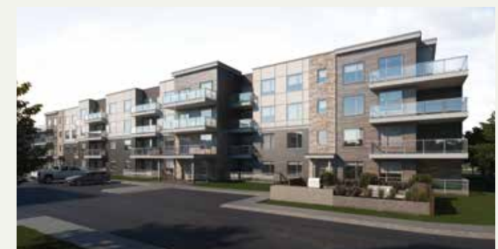
PARK SOUTH AT FISH CREEK EXCHANGE - CALGARY