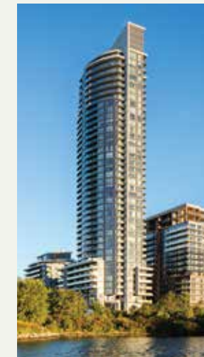
OCEAN CLUB - TORONTO

BUILT FOR TODAY AND BUILT FOR TOMORROW, BY GRAYWOOD