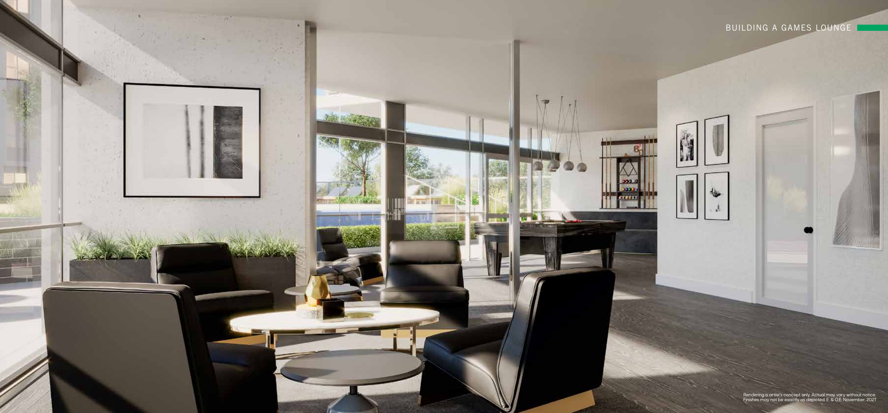
Rendering is artist's concept only. Actual may vary without notice. Finishes may not be exactly as depicted. E. & O.E. November, 2021