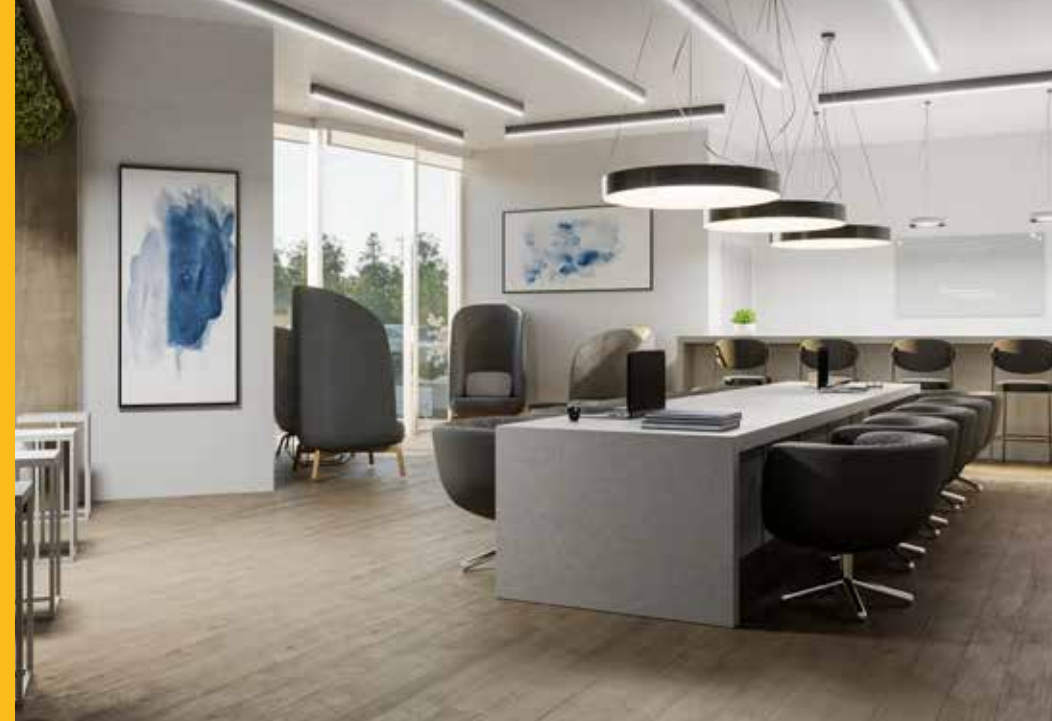
BUILDING A WORK STUDY LOUNGE