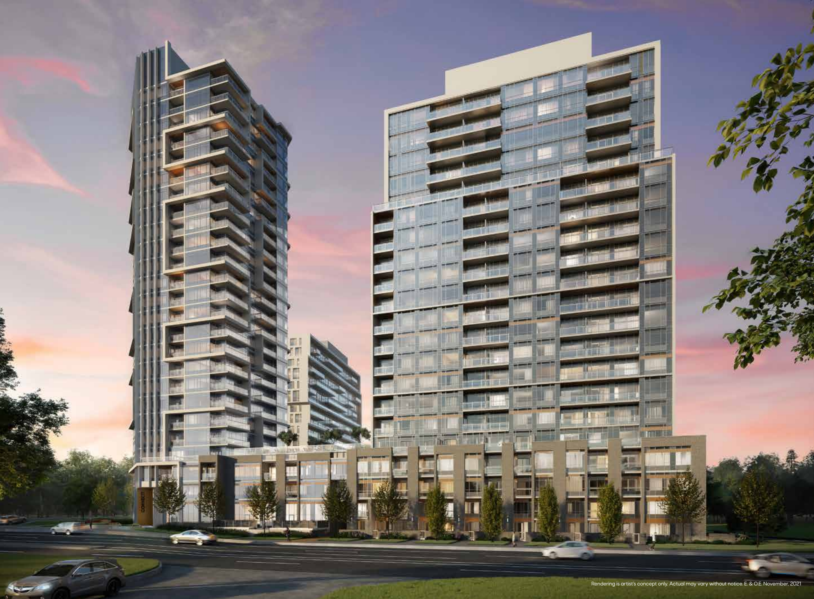
Rendering is artist's concept only. Actual may vary without notice. E. & OE. November, 2021

Start with a vibrant location in the heart of Milton