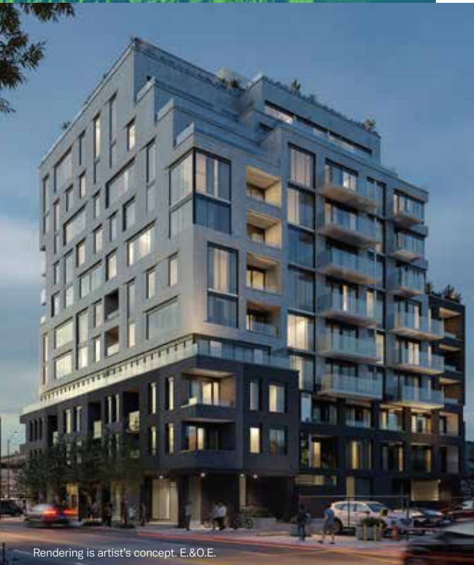
Rendering is artist's concept. E.&O.E.