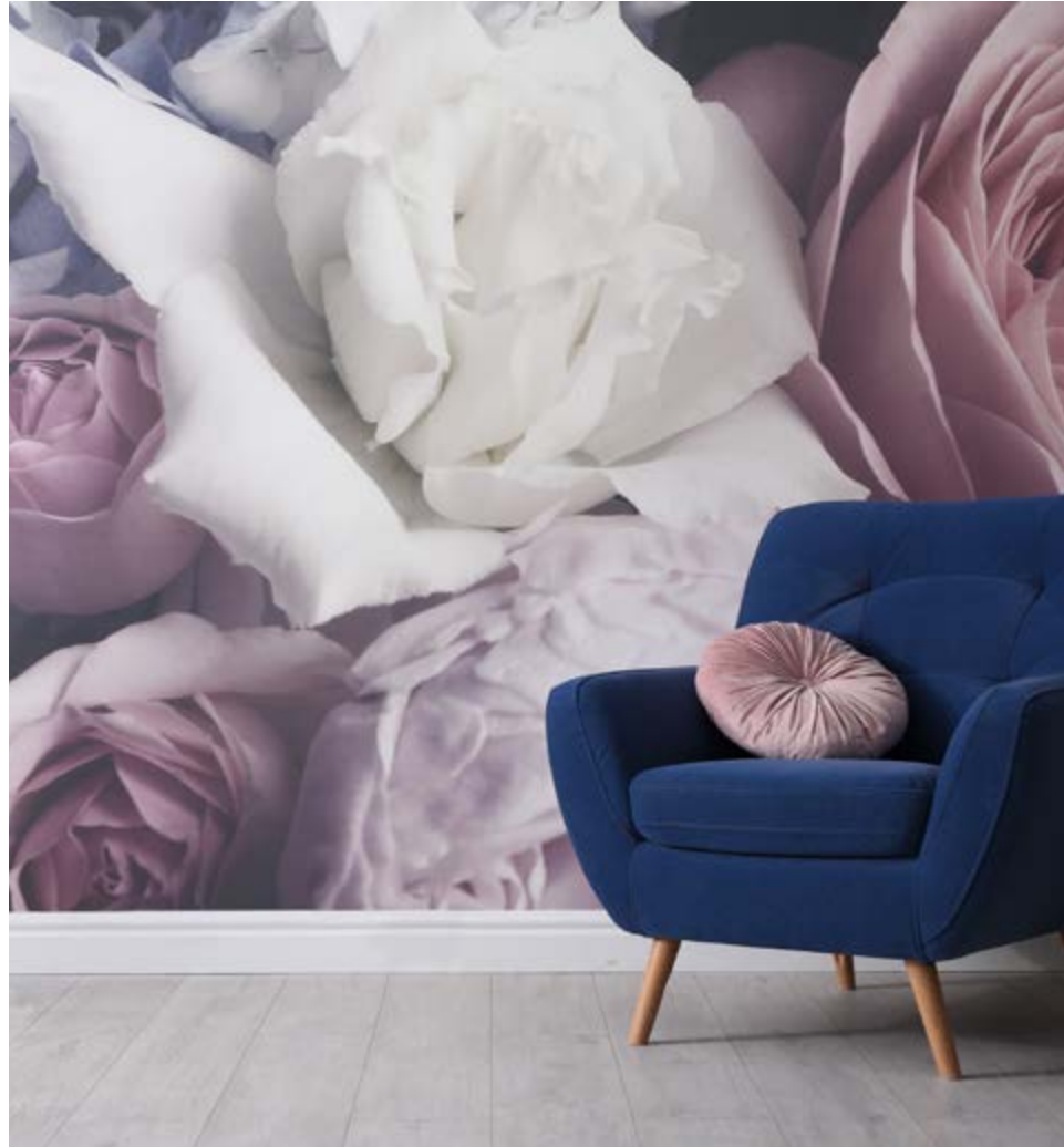
OWNER'S LOUNGE MEDIA / REC ROOM