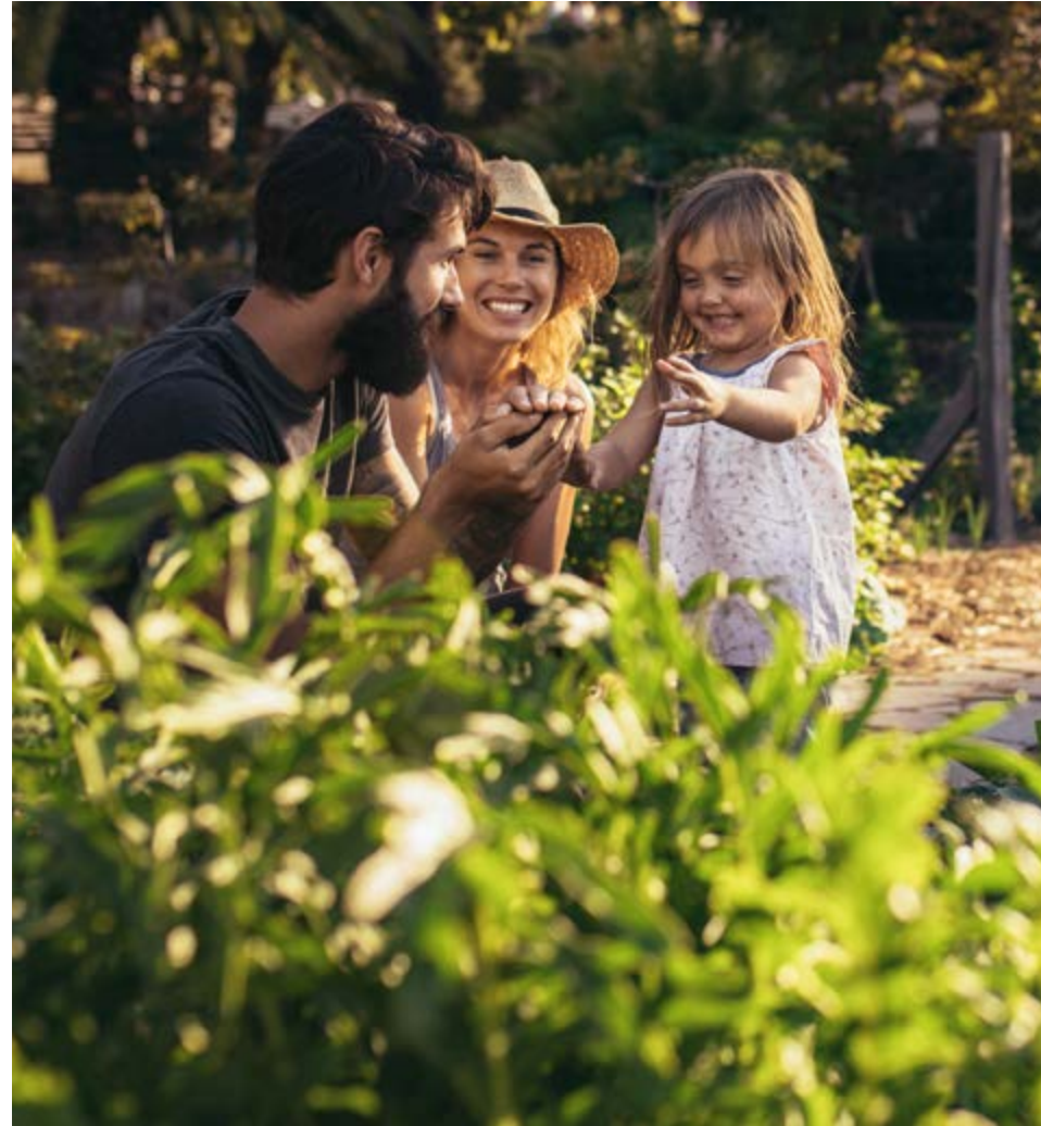
GREAT LAWN & COURTYARD OUTDOOR LIVING AREA