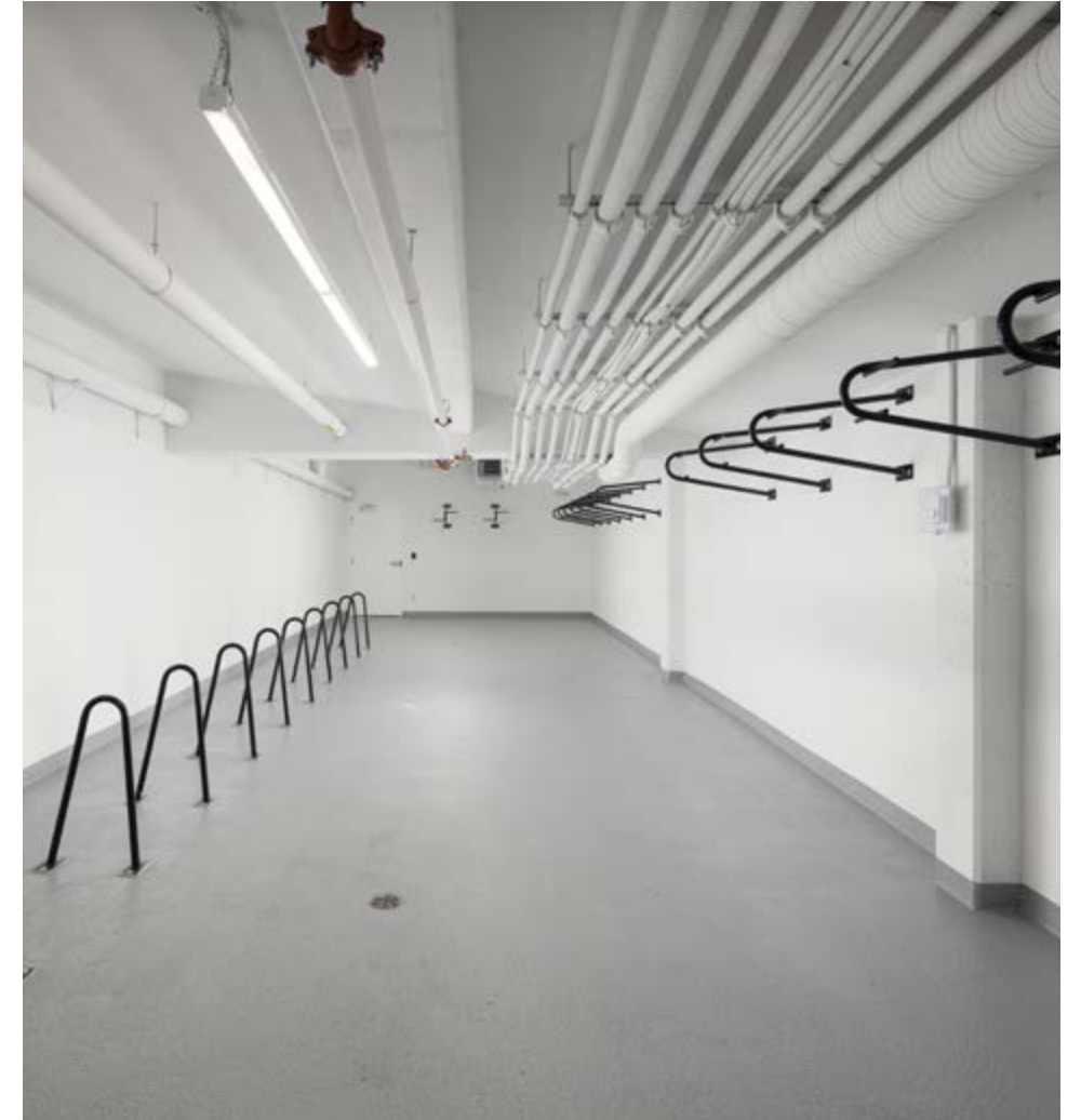
BIKE ROOM BICYCLE STORAGE & WORKSHOP