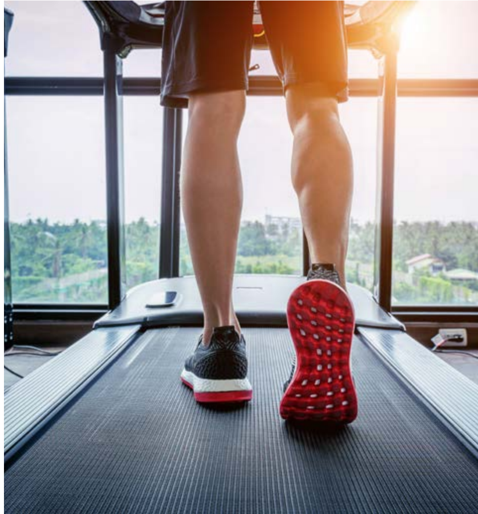
EXERCISE ROOM GYM / WEIGHT ROOM