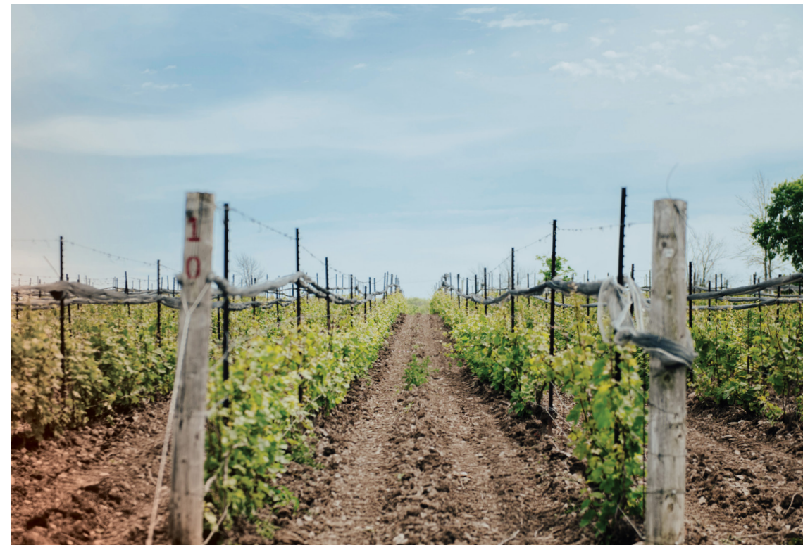
Norman Hardie Winery