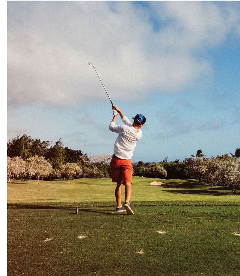
Bay of Quinte Golf & Country Club