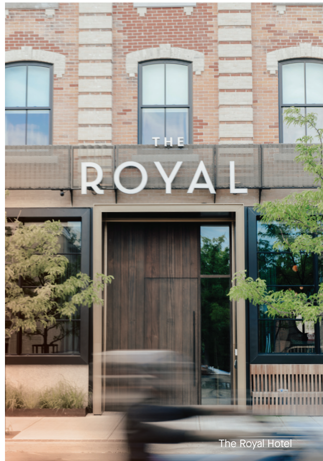
The Royal Hotel

A favourite getaway for wine-enthusiasts near and far, this premiere wine region draws in nearly 700,000 visitors every year. It's also home to a wide variety of well-loved local hotels, restaurants, artisanal markets, cafés, and shops.