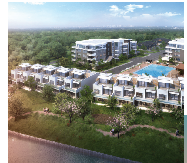
Fenelon Lakes Club