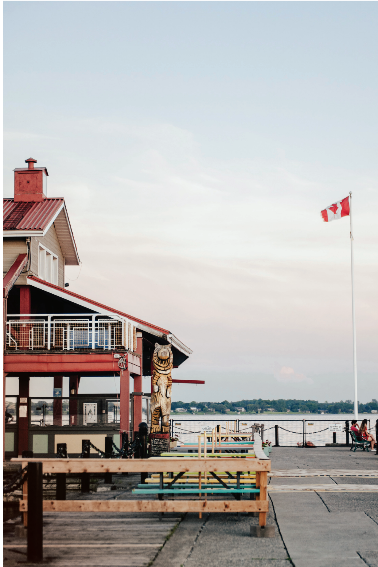
The Pier Patio Bar & Grill