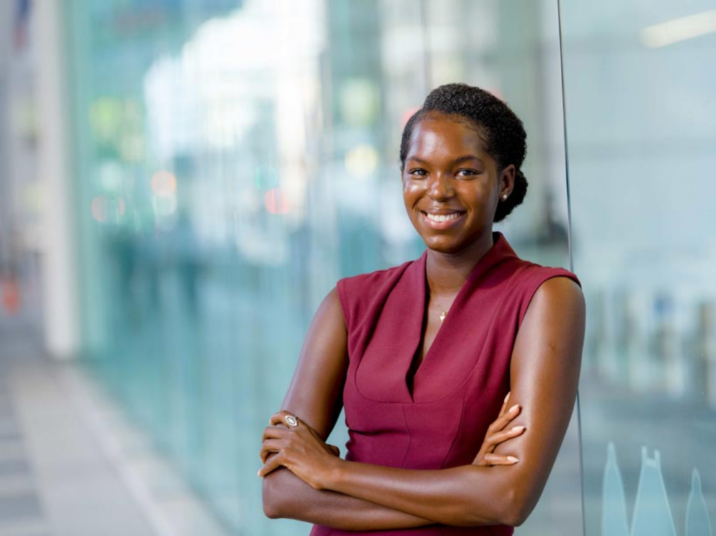
A new approach to law