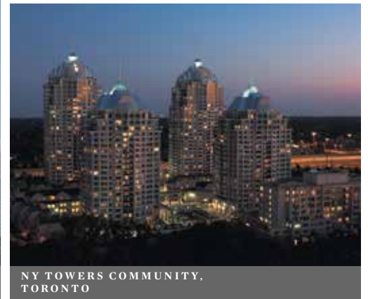
NY TOWERS COMMUNITY, TORONTO