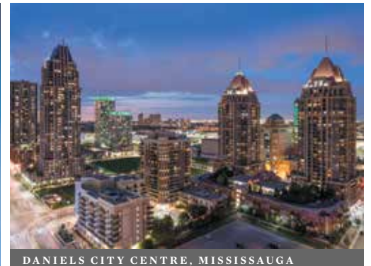
DANIELS CITY CENTRE, MISSISSAUGA