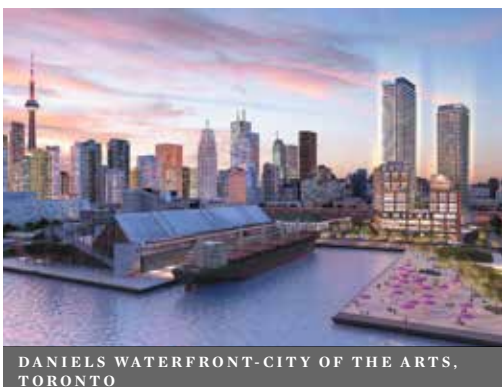
DANIELS WATERFRONT-CITY OF THE ARTS, TORONTO