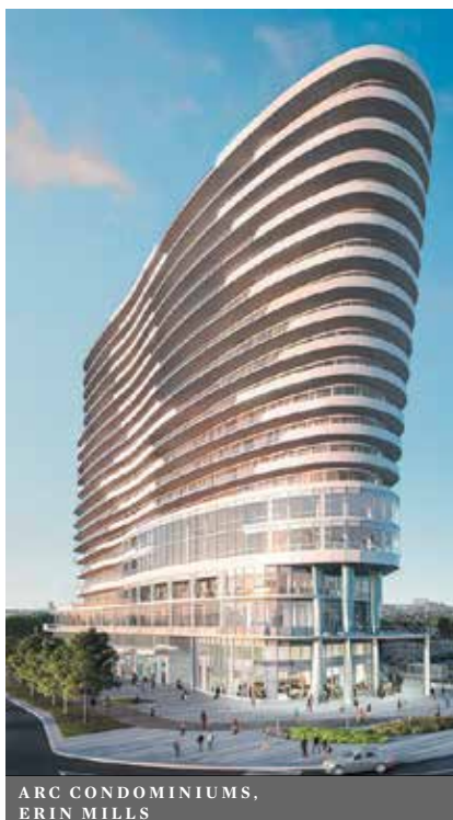
ARC CONDOMINIUMS, ERIN MILLS