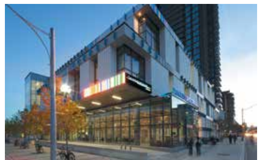
DANIELS SPECTRUM, REGENT PARK