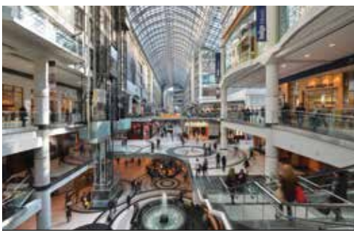
CF TORONTO EATON CENTRE