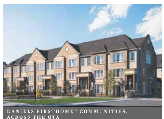
DANIELS FIRSTHOME™ COMMUNITIES, ACROSS THE GTA