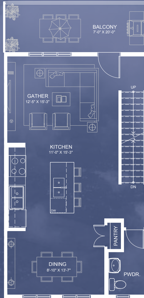
MAIN LEVEL ±689 SQ. FT.