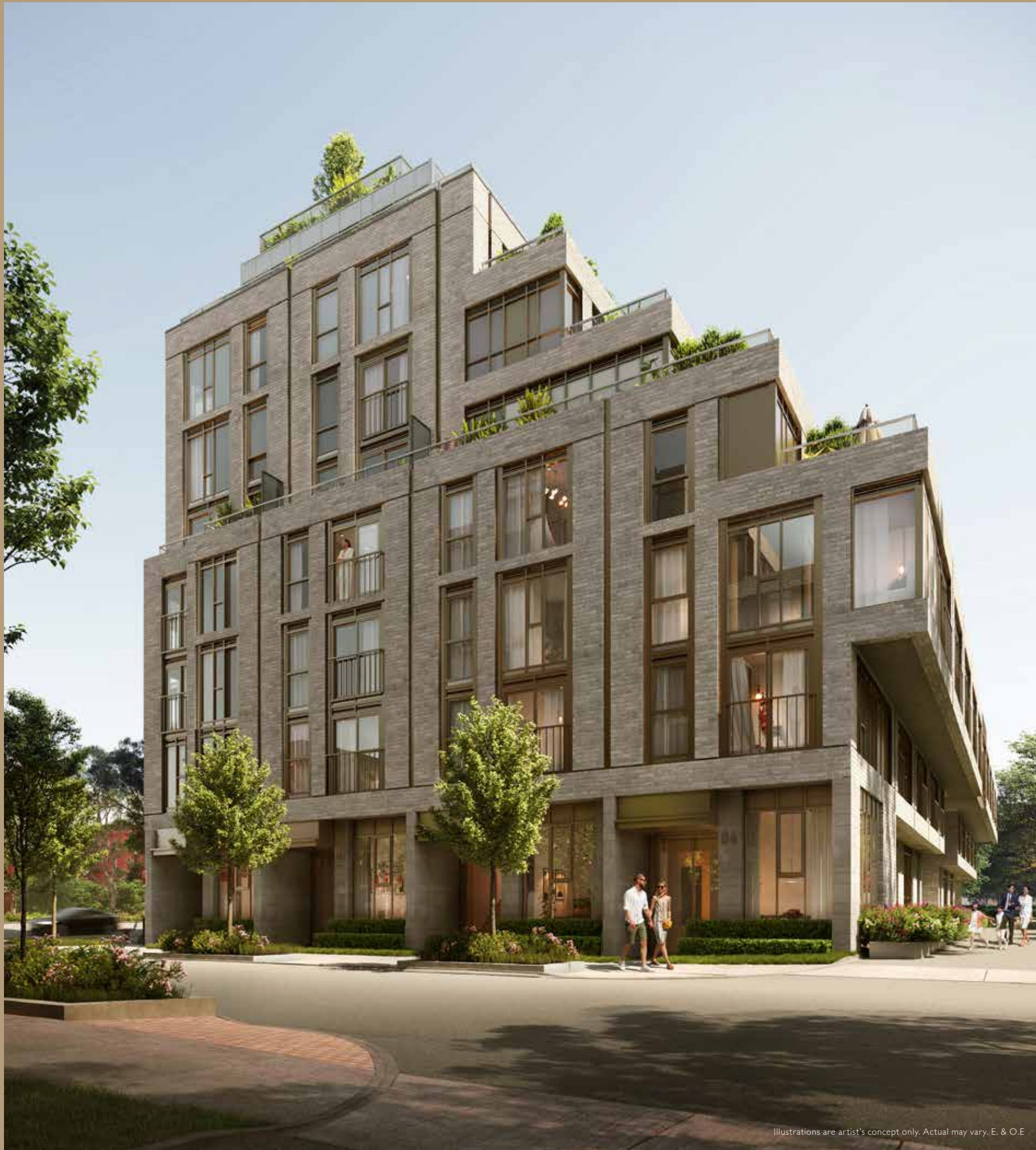
LEFT The Leaside

Welcome to The Leaside, a modern luxury boutique condominium by EMBLEM Developments, Core Development Group, and Fiera Real Estate making an eloquent statement of style and glamour in one of Toronto's most desirable neighbourhoods. Surrounded by parks and ravines, fine shopping and dining, renowned schools, and superb connectivity this distinctively designed midrise residence offers effortless sophistication. The lifestyle you have aspired to live is now within reach.