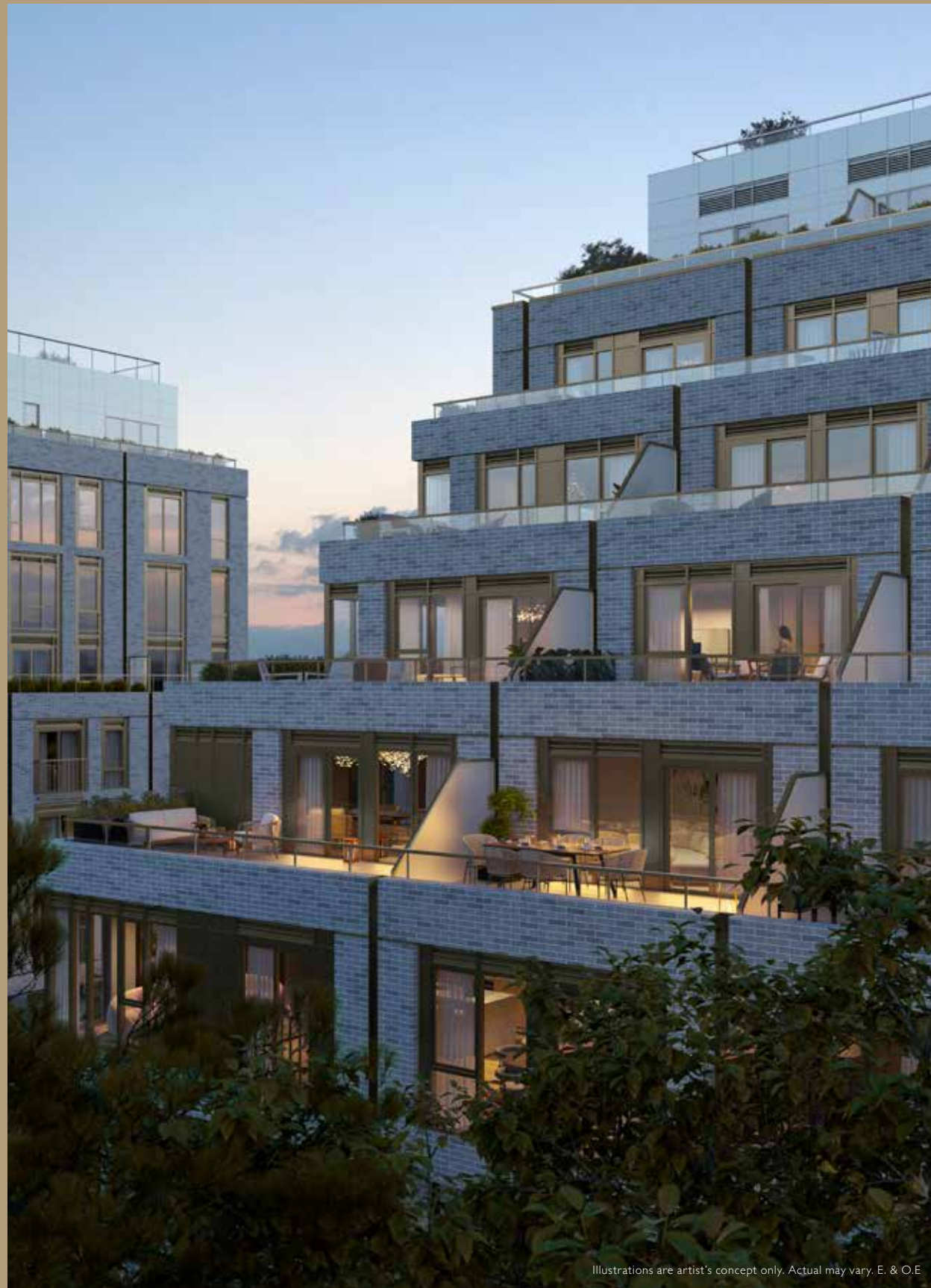
Illustrations are artist's concept only. Actual may vary. E. & O.E