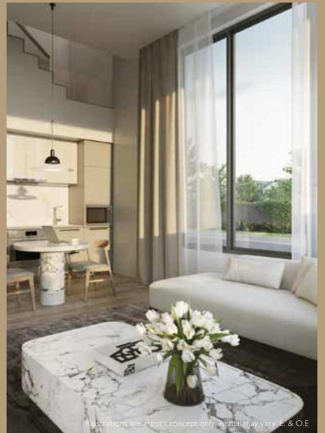
Illustrations are artist's concept only. Actual may vary. E. & O.E

Generous space considerations bestow a feeling of calm & freedom from cares. The primary bedroom bequeaths a journey of dreams enveloped in the utmost comfort.