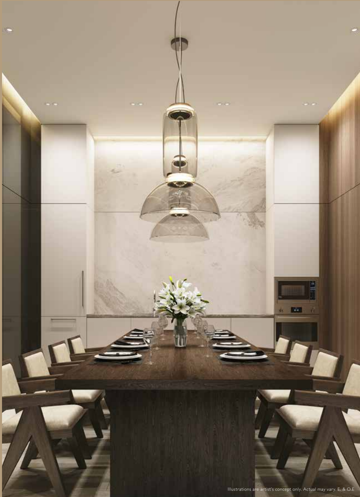
Illustrations are artist's concept only. Actual may vary. E. & O.E