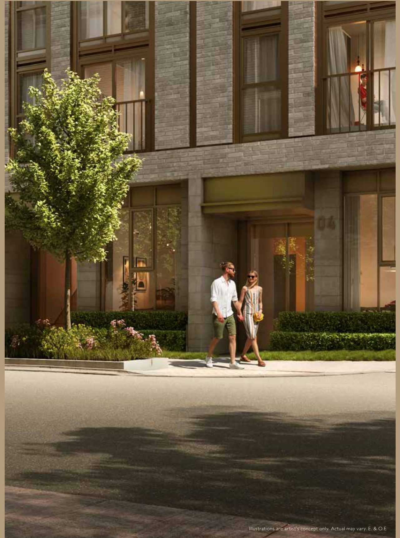
Illustrations are artist's concept only. Actual may vary. E. & O.E

Exhibiting contemporary flair and timeless elegance, The Leaside's two opulent buildings stand side by side, lavishly embellished with gold accents. The architects of Turner Fleischer have designed The Leaside to be an integral part of the neighbourhood, embodying the values of discrete luxury and attention to detail. The two lovely buildings face the street in all their glory, offering a feeling of comfort amidst the creativity of architecture that serves to enhance and meld with the illustrious area.