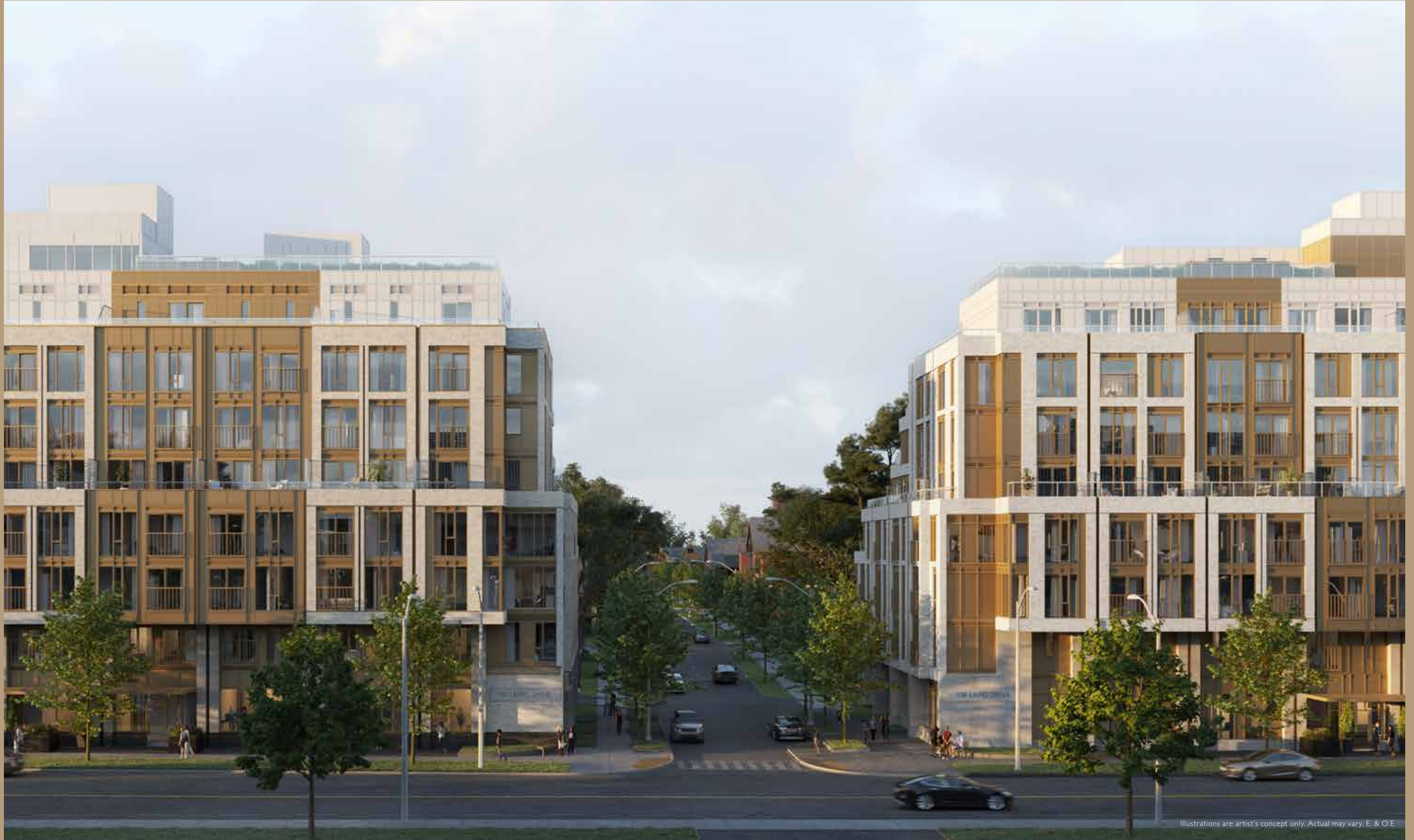
Illustrations are artist's concept only. Actual may vary. E. & O.E