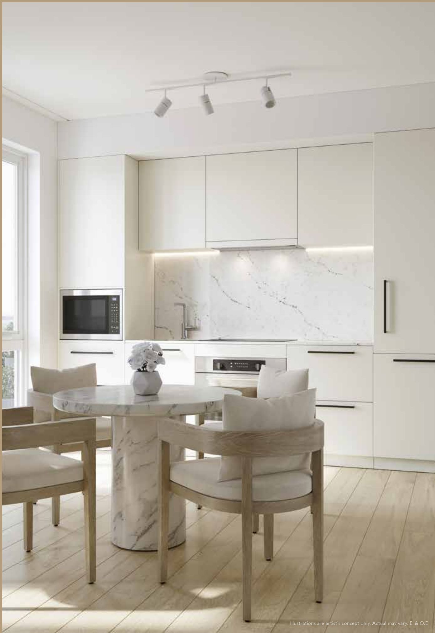
Illustrations are artist's concept only. Actual may vary. E. & O.E

Poised above the affluent neighbourhood of Leaside, the penthouses offer poetry embodied in views, space, & breathtaking design. Natural light flows in to bathe the open concept living area in a warm glow.