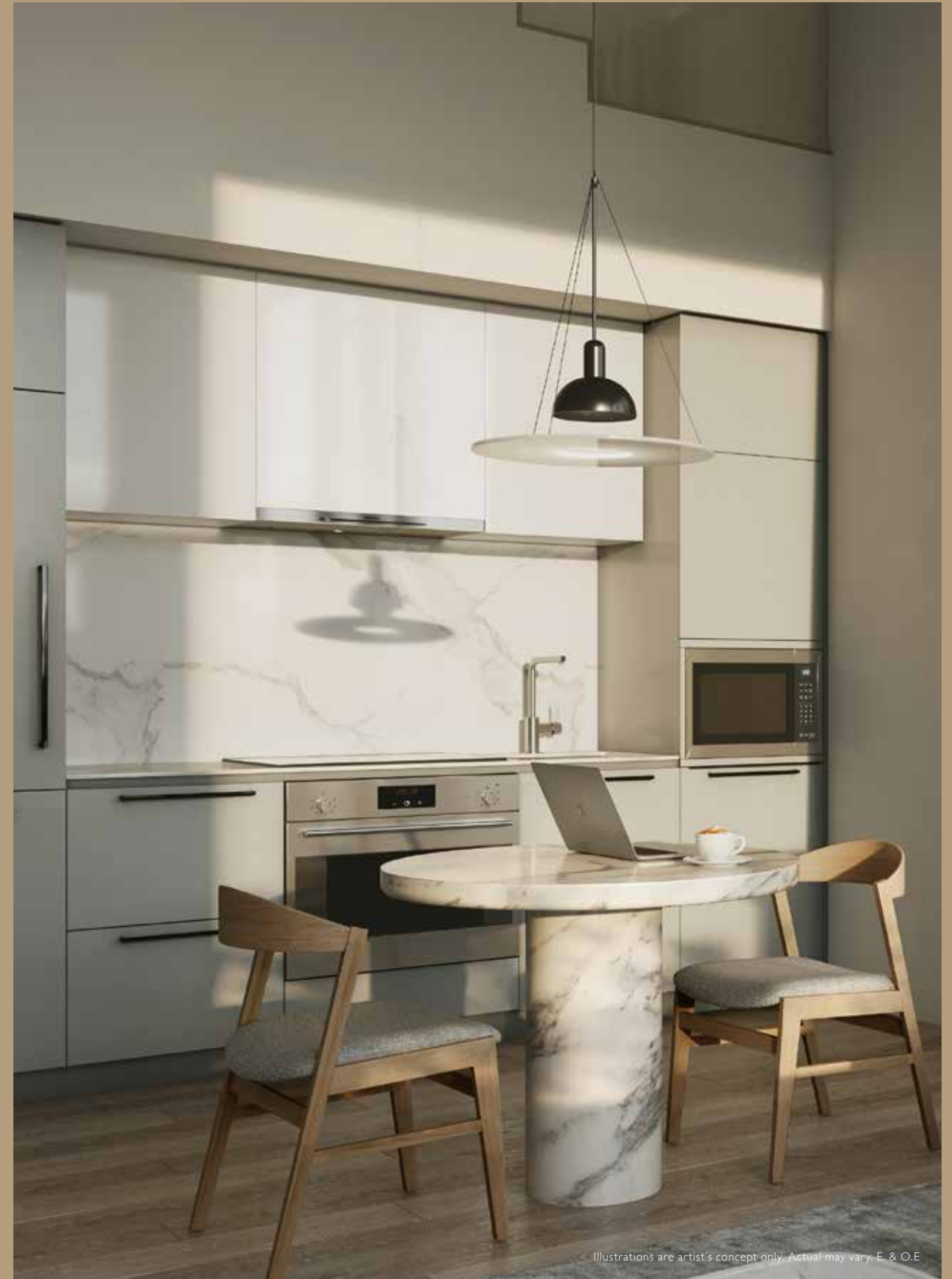
Illustrations are artist's concept only. Actual may vary. E. & O.E

Signalling a devotion to craftsmanship and elegant style, The Leaside's spaces confer a mood of repose and rejuvenation. Contrasts of dark and light, hard and soft, convey visual appeal.