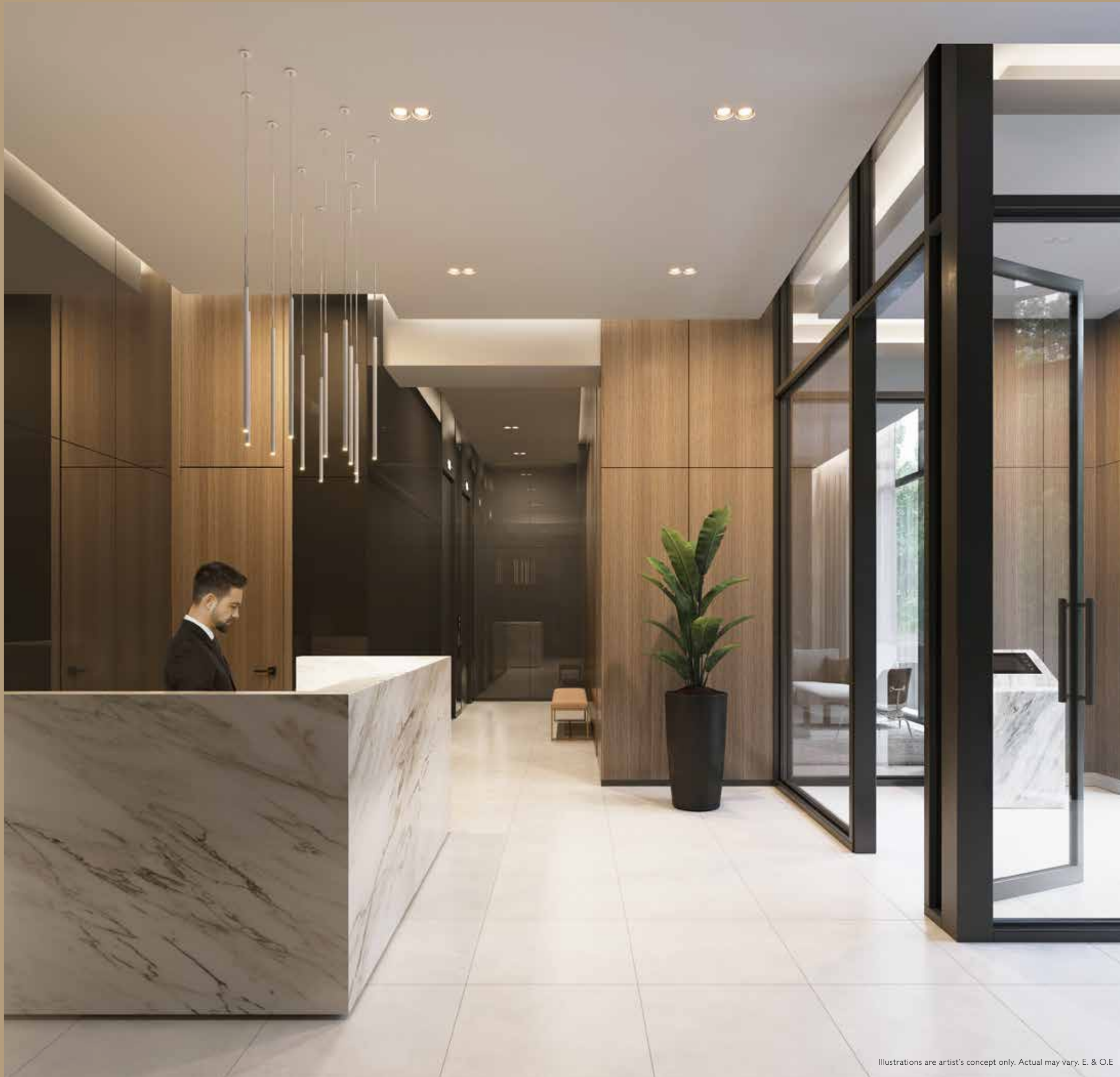
Illustrations are artist's concept only. Actual may vary. E. & O.E