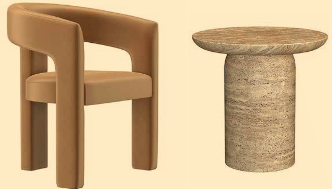
The furniture pieces depicted are for illustrative purposes only and may not necessarily be the ones procured for the project. In that event, furniture pieces of comparable style and quality will be procured.