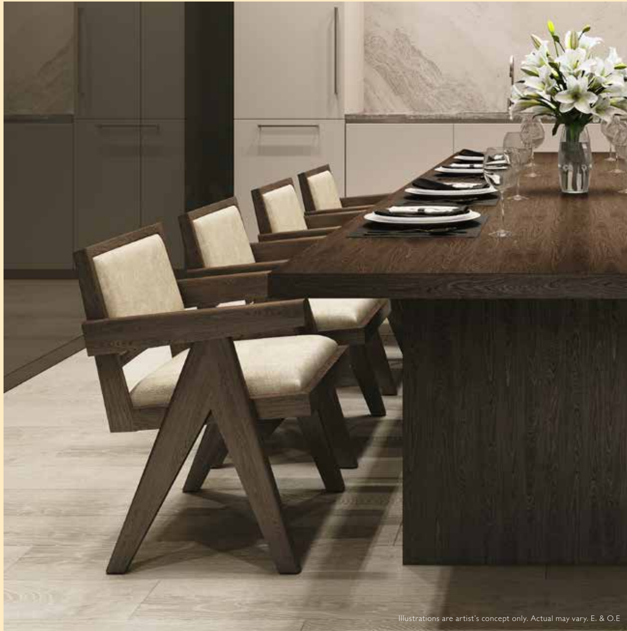
Illustrations are artist's concept only. Actual may vary. E. & O.E

This luxury building amenity exudes elegance. Creating a refined and sophisticated ambiance for residents and visitors, the carefully curated space boasts a tasteful selection of RH furnishings, showcasing impeccable craftsmanship and timeless designs.