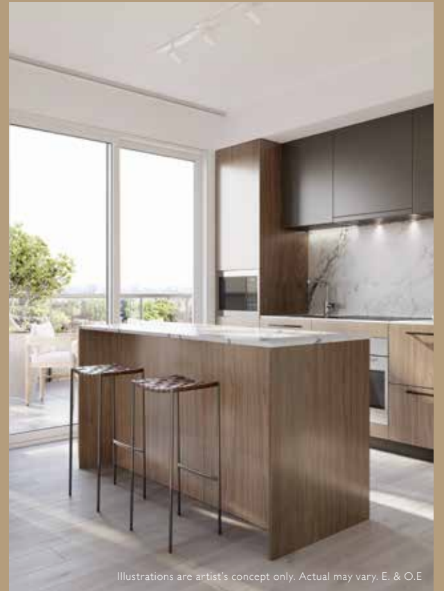
Illustrations are artist's concept only. Actual may vary. E. & O.E

Poised above the affluent neighbourhood of Leaside, the penthouses offer poetry embodied in views, space, & breathtaking design. Natural light flows in to bathe the open concept living area in a warm glow.