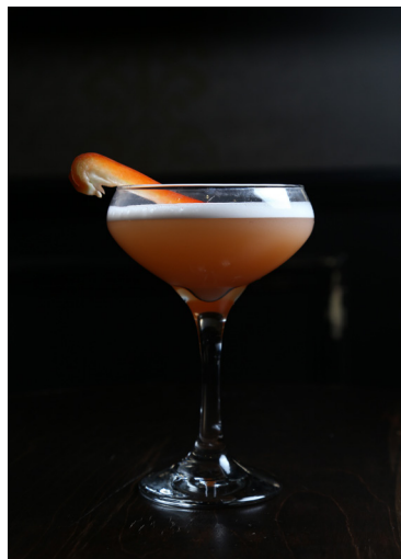
Chiang Mai: Experience a taste of Thailand close to home at this stylish spot serving flavourful dishes and cocktails.