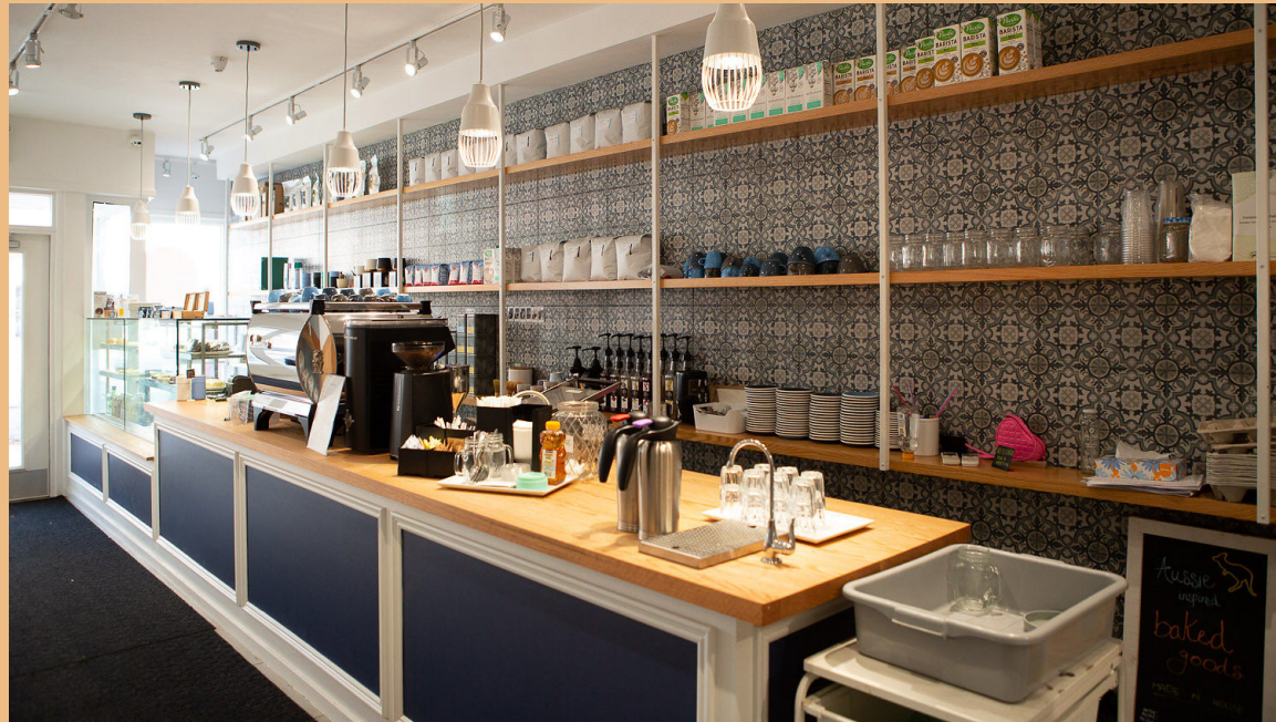
The Sydney Grind: Head down under for some Sydney-style coffee and treats at this beautifully designed, Aussie-owned café.