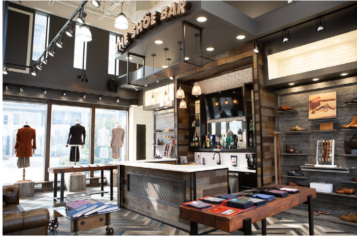
Soren Custom Suits: Find your perfect fit and suit up in style with a made-to-measure masterpiece that captures the essence of cool.

You'll find just what you need only minutes away at Sherway Gardens, or charming shops and restaurants just steps from your home. Play around or take a stroll through Queensland Park. Enjoy a slice from The Pie Commission, some fresh sashimi from Sushi Kaji or a pint or two at Great Lakes Brewery. Explore the scenic streets of Swansea and head down to Sunnyside Beach to savour stunning lakefront views.