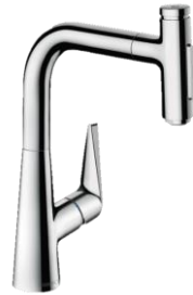
Pull out spray kitchen mixer