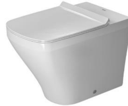
Floor Standing Toilets