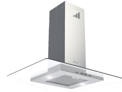
Touch control extraction Hood