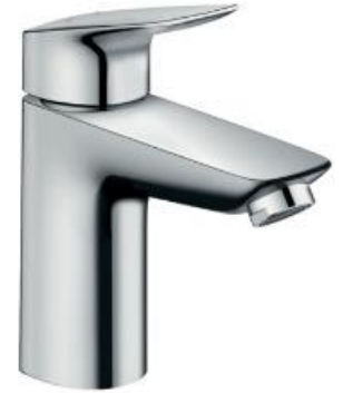
Water Efficient Mixers

* Images are for references only and models may vary according to availability and apartment type.