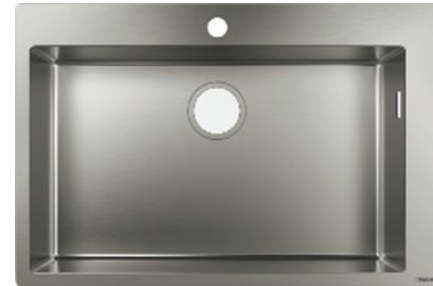
Stainless-steel built-in sink