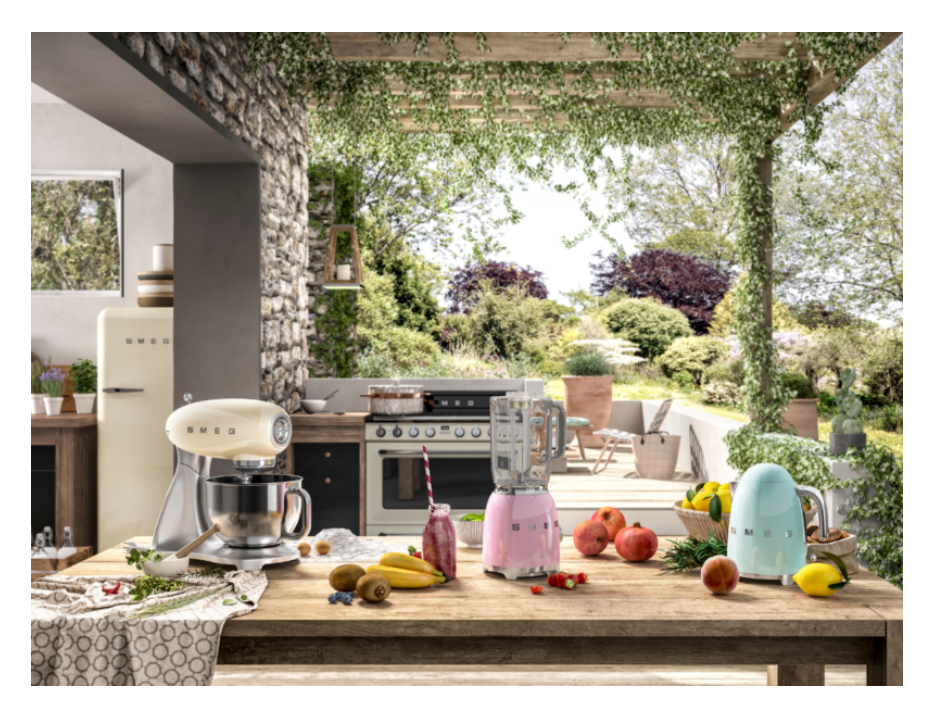
SMEG appliances in the iconic Retro Collection. This is not the collection that will be included in Arcadia District.