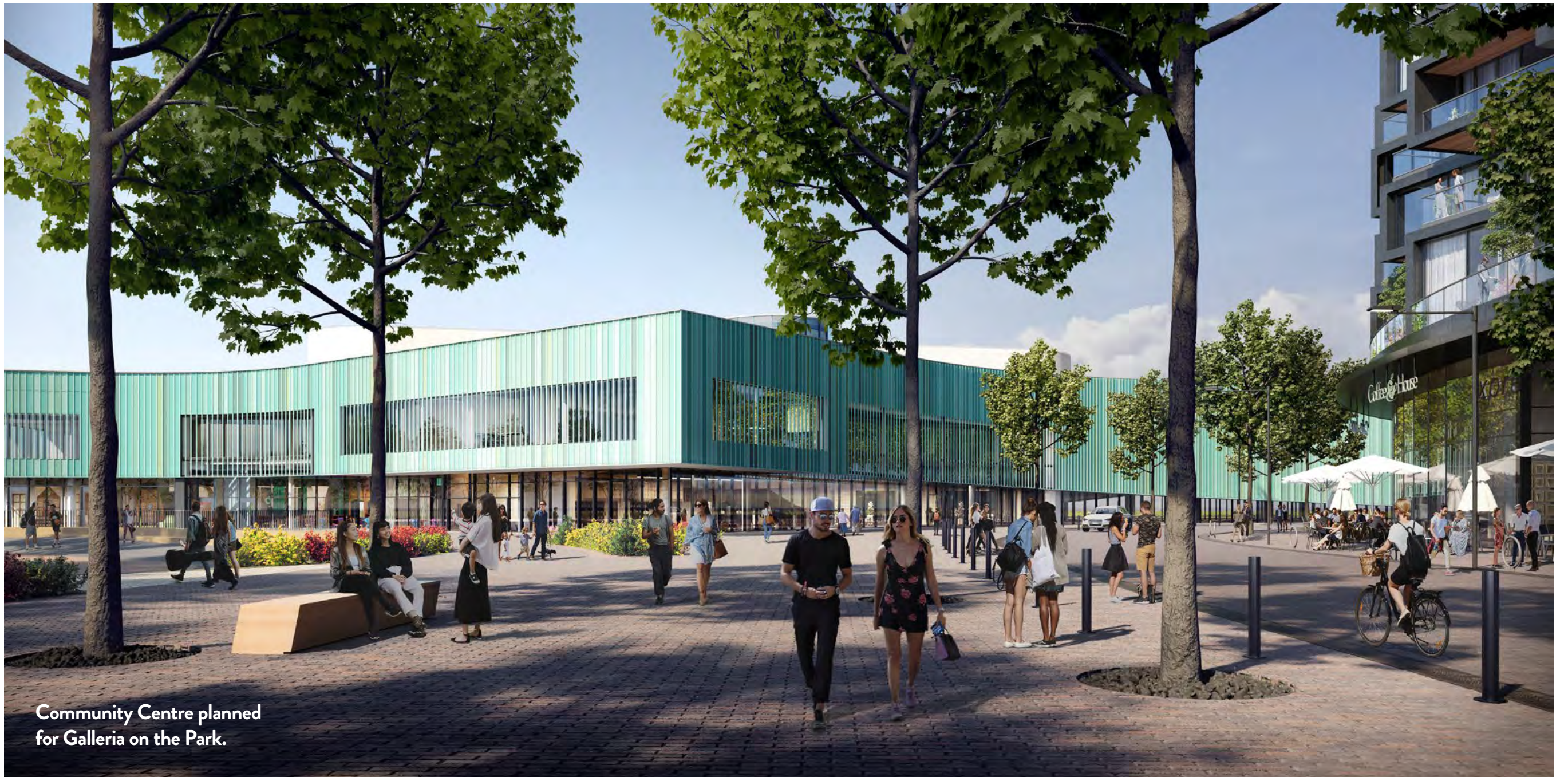
Community Centre planned for Galleria on the Park.