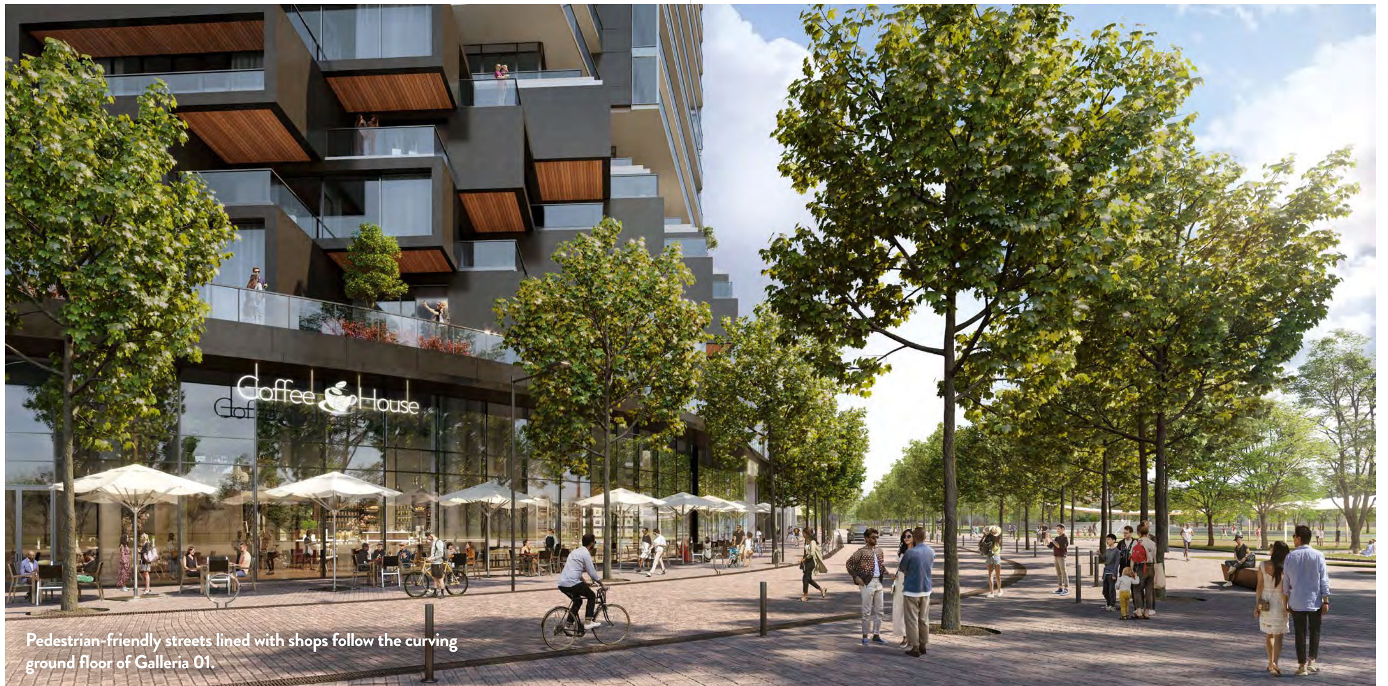
Pedestrian-friendly streets lined with shops follow the curving ground floor of Galleria 01.