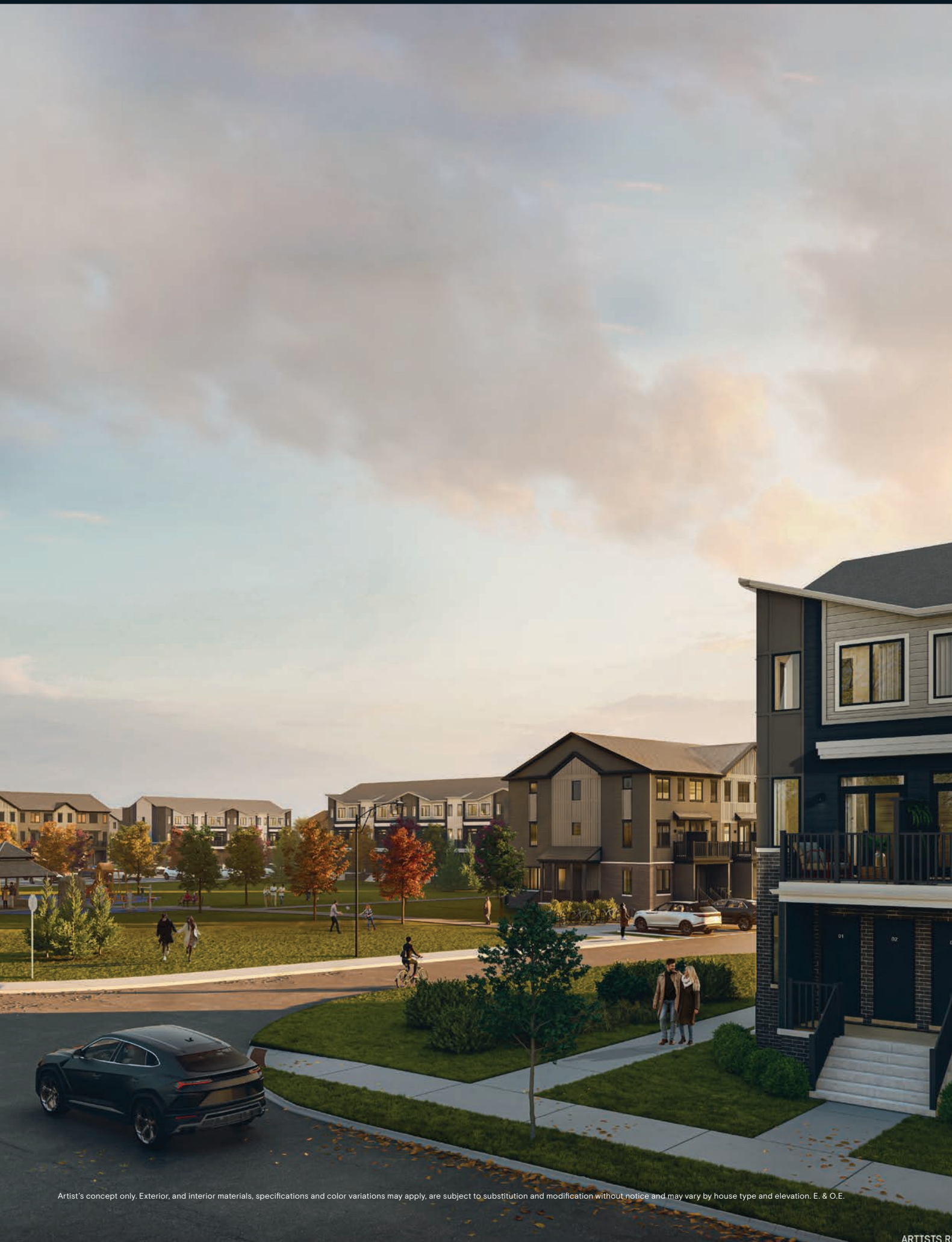
Artist's concept only. Exterior, and interior materials, specifications and color variations may apply, are subject to substitution and modification without notice and may vary by house type and elevation. E. & O.E.

At Orléans Village, you can enjoy the great outdoors year-round, with a 16-acre pond and an incredible 100 acres of green space, and walking paths at your doorstep. Meet your neighbours on an evening stroll, have fun with your kids at the local playground, join a local sports club at the local recreation complex. Orléans Village connects you to your neighbors and gives you space to unwind.