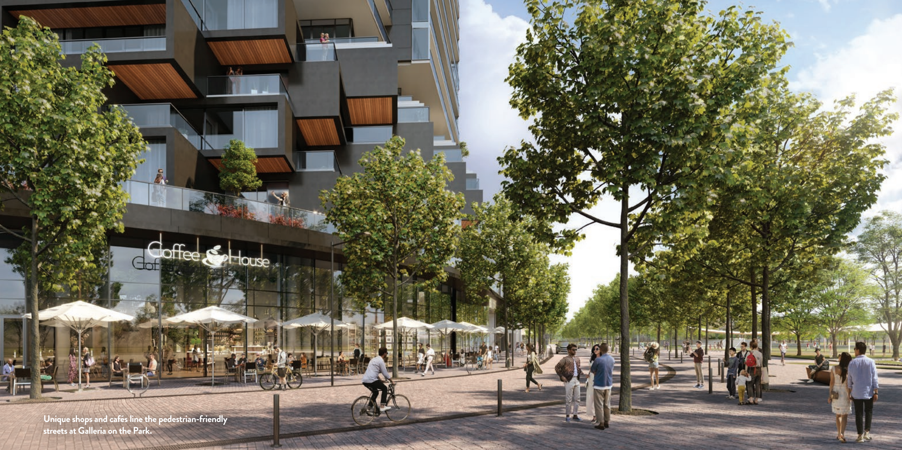
Unique shops and cafés line the pedestrian-friendly streets at Galleria on the Park.