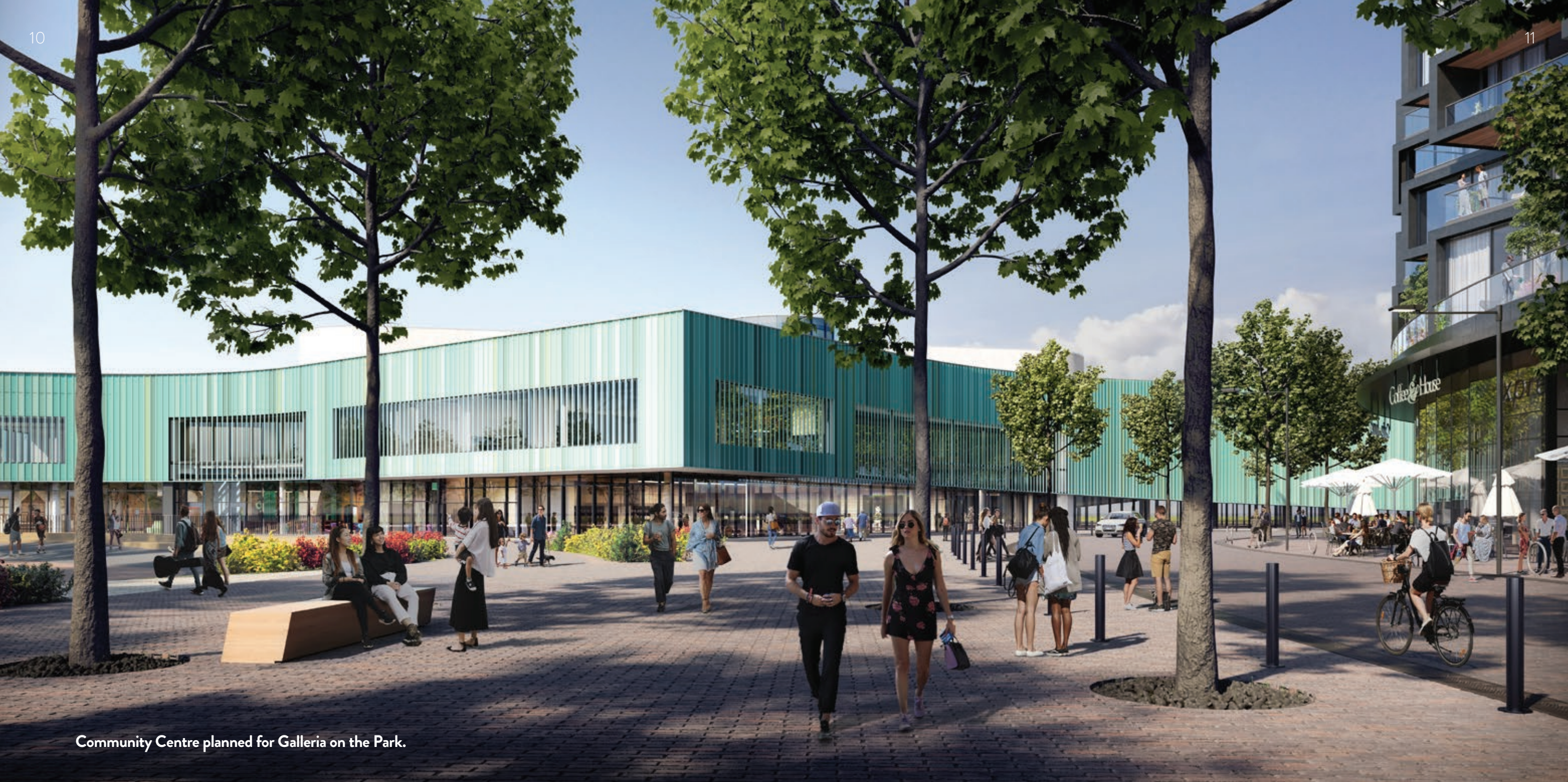
Community Centre planned for Galleria on the Park.