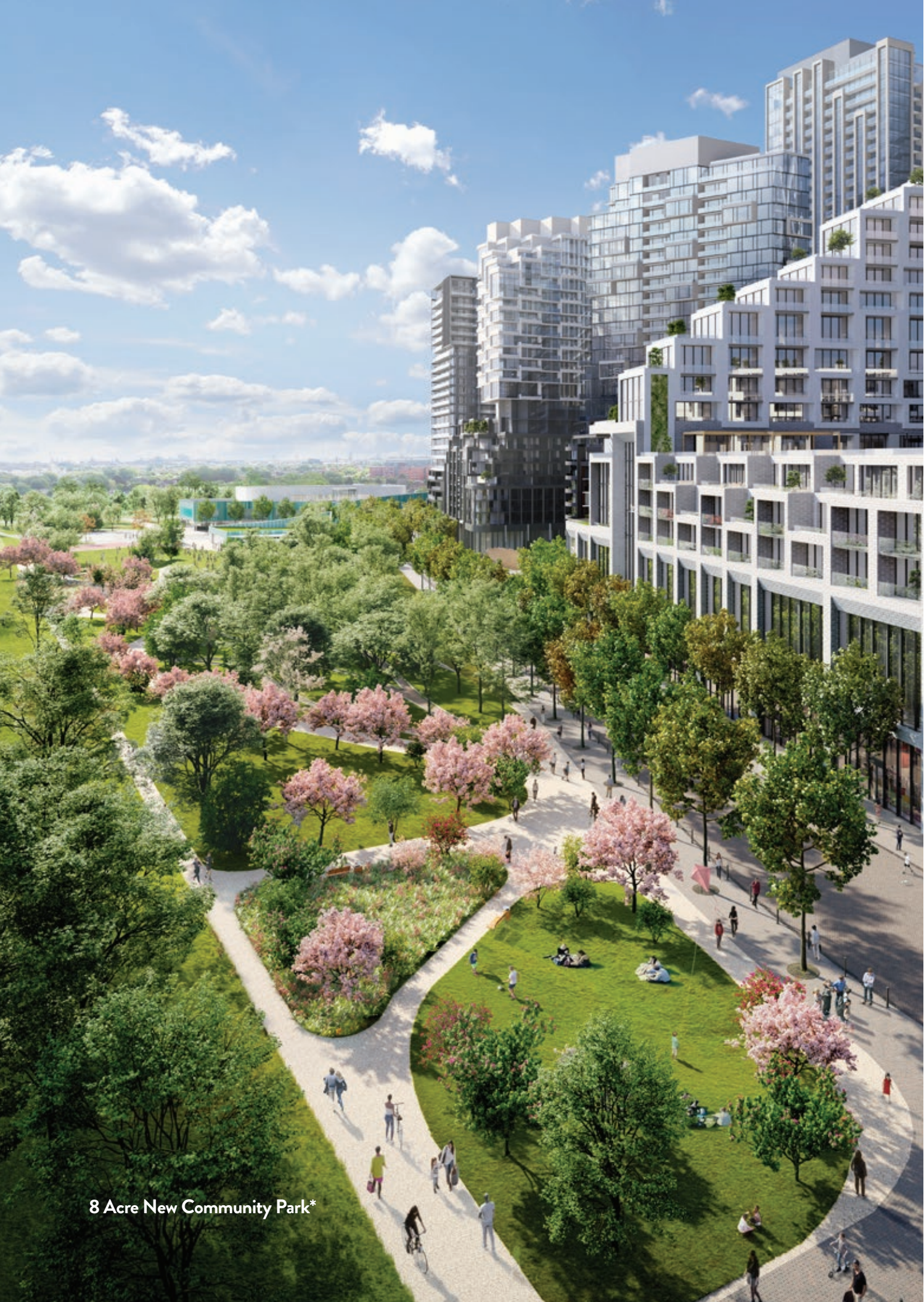
8 Acre New Community Park*

Always a green magnet for the neighbourhood, the existing Wallace Emerson Park will be expanded to eight acres, revitalized and redesigned to be even more enticing, and maximizing sunlight and south views of the Toronto skyline. The new design features three multi-functional spaces*: The Community Heart with a BMX/skateboard park, a multi-use sport court and skating pad, along with a skating trail; The Play Heart* , a multi-use green field with a hill that invites all Torontonians of all ages to gather and play; and The Nature Heart* with a treed canopy and meandering pathways for wandering and relaxing in a natural setting.