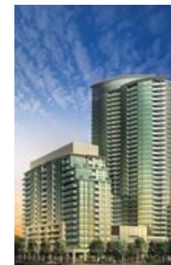
INFINITY 1 & 2 TORONTO