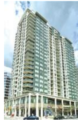
MAJESTIC 2 NORTH YORK

Building with five decades of excellence, The Conservatory Group is proud to be at the forefront of the industry, shaping new home communities across the Greater Toronto Area.