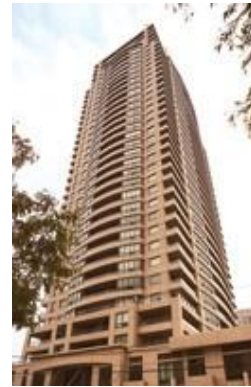
PLATINUM NORTH YORK