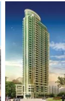
WIDE SUITES MISSISSAUGA